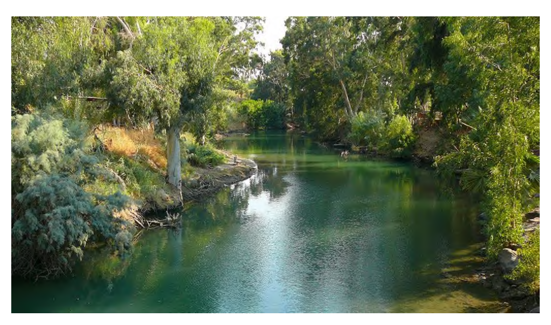
The River Jordan

We must <u>know</u> him, dear reader! We must <u>know</u> him. That, and that alone, is the basis of our eternal salvation.