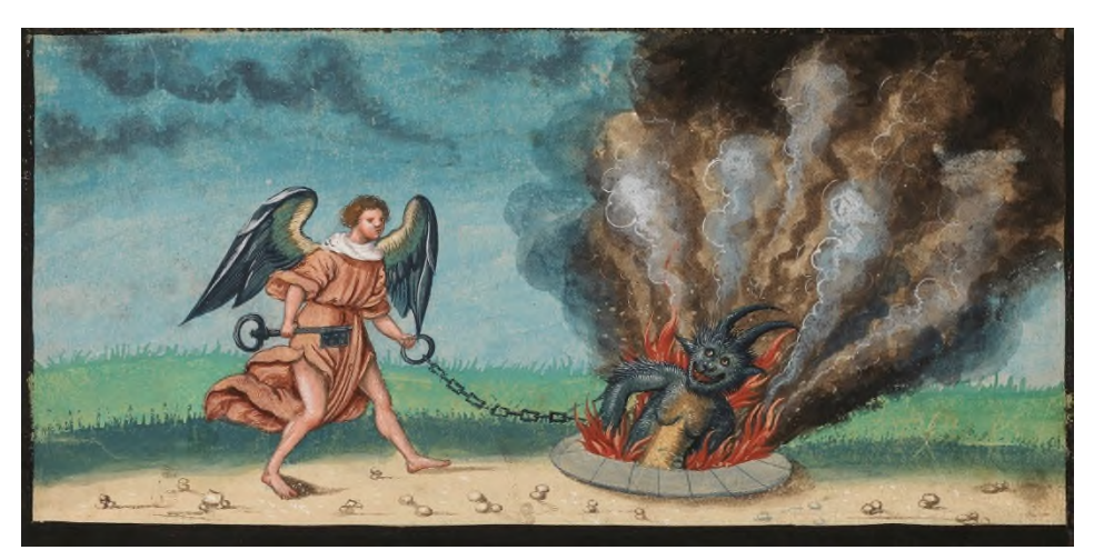
An Angel Chains the Dragon, Augsburg School c 1550

The "man" here denotes the final King of Babylon, the Antichrist himself. How miserable he will appear to those who see him in the depths of hell. For all his horrific destructiveness while on earth, he was never more than a man. Of course, he was imbued for a time with the supernatural power of Satan, but that didn't last very long. Besides, by this time his demonic master is also in chains, having been consigned to the Abyss for a thousand years!