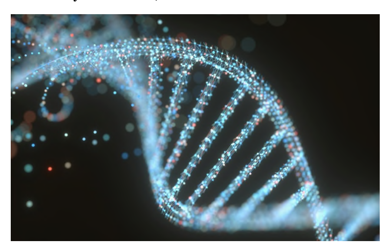
"fearfully and wonderfully made" - Don't touch it!

But our pastors think they know best, and wisdom cries in the streets.