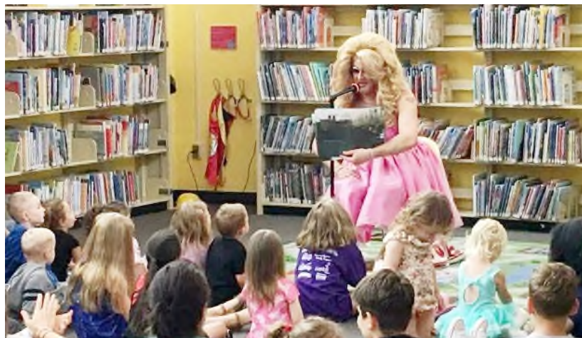
One of numerous Drag Queen Story Hour sessions in U.S. public libraries.

Anyone with an ounce of common sense or a modicum of human decency would know that a young child should never be exposed to sexual propaganda. Even diehard atheists, who have little regard for absolute moral values, would accept this. So why did Dun Laoghaire/Rathdown library service consider this activity, aimed at very young children, to be appropriate, suitable, or even sane? This service is funded by the taxpayer through Dublin County Council, so why did the Council give its approval? And the staff of Deansgrange library have a voice, so why didn't they use it in defense of little children?