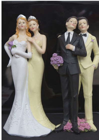
The absurd conceit known as ‘gay marriage’.

This change in direction was already evident on 22 May 2015 when the people of Ireland voted, again overwhelmingly, to abolish Christian marriage. They decided that the lifelong union of a man and a woman in the bond of matrimony was morally equivalent to a partnership between cohabitating homosexuals. Their ignorance of the harm done by sodomy and the so-called ‘homosexual lifestyle’ was almost as great as their ignorance of the moral order that has nourished and sustained mankind for millennia.