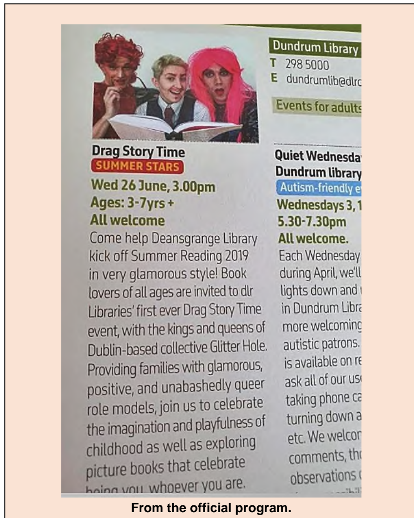
From the official program.

Let's look at some facts regarding this proposed event. It was scheduled to mark Dublin 'Pride' week and was therefore a strategic homosexual event, designed to acquaint children as young as three with the strange world of homosexual cross-dressing and camp behavior. The performing troupe or collective was called 'Glitter Hole', which is a common slang term for the ever-available anus of the promiscuous homosexual – a fact which none of the three national newspapers bothered to note. There was no indication in the reports that the troupe had police (Garda) clearance to intermingle with very young children. This is a point of particular importance given that the event focused sharply on the ideology of sexual identity and was deliberately designed to normalize behavior which a child might otherwise treat with caution. The newspapers also failed to state that the troupe specializes in bawdy sexual performances for an adult audience, where lewd, degrading and provocative behavior is applauded by people who celebrate the queer lifestyle and reject traditional Christian values. The official program for the event even stated that it would offer children “unabashedly queer role models.”