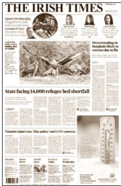
They have far more in common than most people realize.

In its edition dated 3<sup>rd</sup> February 2024, The Irish Times carried an article in which "many of the most prominent organisations and politicians" set out their views on the proposed changes to Article 41. Bear in mind, as a cunning mouthpiece for Marxist ideology and an ardent supporter of the new morality, The Irish Times rarely allows a traditional Christian perspective to appear in its pages. As might be expected, the 'No' side consisted mainly of apologetic drivel, but two refreshing paragraphs managed to slip through: