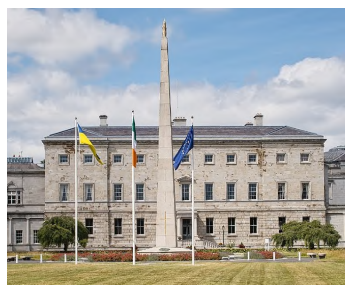
Leinster House: Ireland's principal Babylonian forum, with its massive Masonic obelisk.

The Houses of the Oireachtas passed two Bills on January 23<sup>rd</sup> which decreed that a Referendum would be held on March 8<sup>th</sup> in which two proposed amendments to Article 41 of the Constitution would be put to the electorate. Article 41 deals with the "fundamental rights" of the Family and, as such, is of critical importance in Irish law.