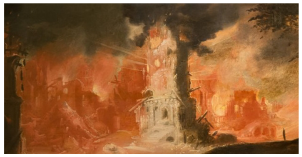
The destruction of Sodom.

"For there are certain men crept in unawares, who were before of old ordained to this condemnation, ungodly men, turning the grace of our God into lasciviousness, and denying the only Lord God, and our Lord Jesus Christ...Even as Sodom and Gomorrha, and the cities about them in like manner, giving themselves over to fornication, and going after strange flesh, are set forth for an example, suffering the vengeance of eternal fire. Likewise also these filthy dreamers defile the flesh, despise dominion, and speak evil of dignities...But, beloved, remember ye the words which were spoken before of the apostles of our Lord Jesus Christ; How that they told you there should be mockers in the last time, who should walk after their own ungodly lusts. These be they who separate themselves, sensual, having not the Spirit." (Jude 4, 7, 8, 17-19)