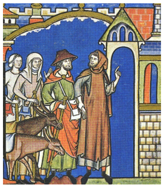
The Levite arrives at Gibeah.

One would have thought that what the Bible teaches about homosexuality would be well understood by the majority of Christians today, but this is not the case. This serious deficiency would seem to have three unrelated causes: (i) few Christians study Scripture as they should and so they lack the basic skills needed to deal adequately with this topic; (ii) by glamorizing sodomy the Enemy has made it very difficult for Christians to speak about it without seeming to be hampered by irrational prejudice; and (iii) the traditional Biblical teaching on sodomy was never deemed by theologians to warrant an in-depth study, primarily because its abominable character was fully evident to anyone who lived and believed God's Word.