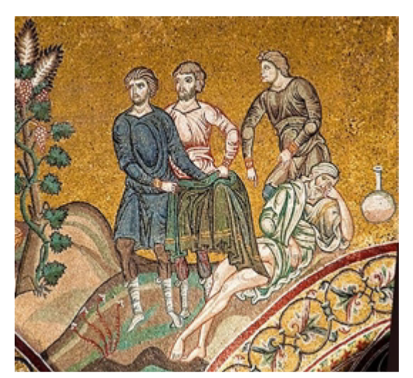
Shem and Japheth cover the nakedness of Noah after he is homosexually abused by Ham's son, Canaan – see Appendix A

These are simple facts of history which the homosexual community today is anxious to suppress. Homosexuality has never been normal. It has never been mainstream. It has never been regarded, even by pagan societies, as anything more than a coarse form of sexual expression which destroyed the social standing of the passive participant in the sex act and enhanced the social dominance of the active party. The power to sodomize and the power to rule were closely linked. That is how it has always been and how it continues to be. Homosexuality is all about power and carnal pleasure. Unfortunately our society today has been tricked into thinking otherwise.