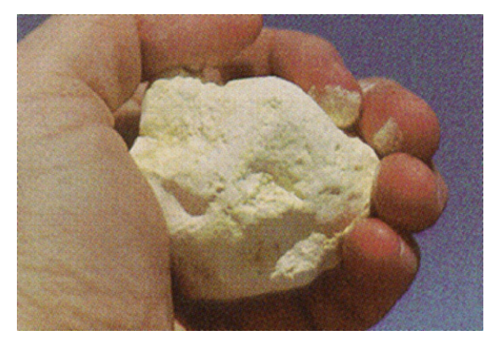
Sulphur balls just like this can still be found in the plain west of the Dead Sea.

Having said that, Christians have a legitimate right to express their concerns about the health implications for society of the homosexual lifestyle, the measures taken by homosexuals to induct young people into a life of sodomy, and the campaign of hatred that radical homosexuals are conducting against anyone, especially Christians, who raise concerns of any kind about their homosexual behavior.