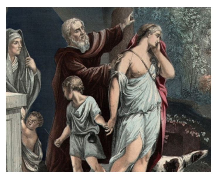
Abraham evicts Hagar on the insistence of Sarah following the occasion where Ishmael "mocked" Isaac – see Appendix A.

What is the most common and persistent expression today – or any time – of our debased human imagination? It is sexual perversion in all its forms. Sexual fantasies and desires of every kind, including the most depraved and unnatural, are produced with ease by our fallen imagination. And unless we exercise control over this perverse and rebellious faculty, it will control us.