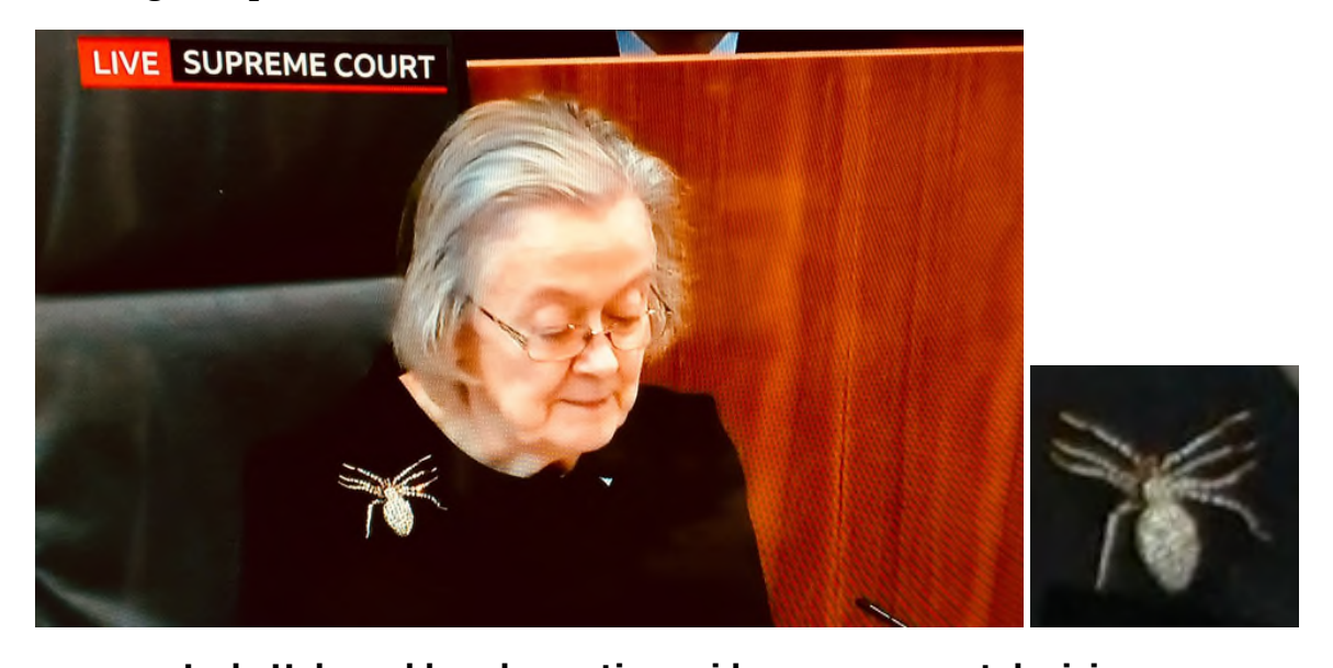
Lady Hale and her decorative spider, as seen on television.

The Illuminati even had the gall to mock the British public for their naivete when the inevitable supreme court ruling to recall Parliament was handed down. Lady Hale, the presiding judge, appeared before the cameras wearing an audacious ornament on her breast, a giant spider!