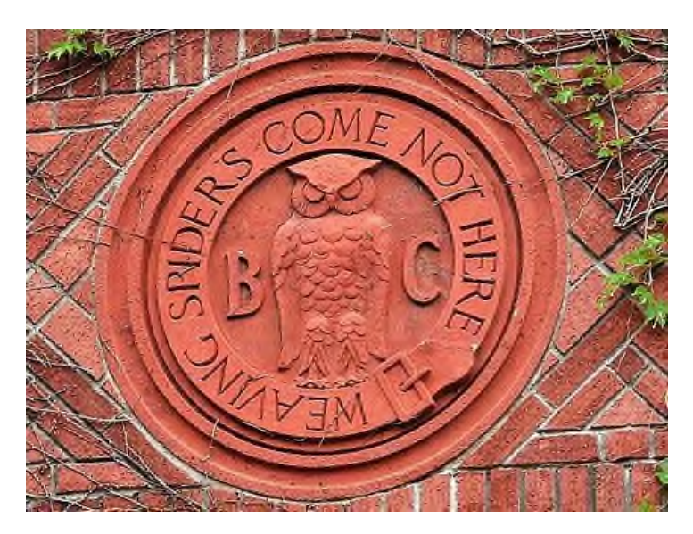
The plaque over the main entrance at Bohemian Grove in Sonoma county, California. It reads: "Weaving Spiders Come Not Here", a line from Shakespeare's, A Midsummer Night's Dream. These words are read aloud before the entire group at the opening ceremony, a death ritual based on Egyptian magick.

This is the kind of item one might wear at a costume party, but not while reading before the nation a ruling of critical importance to their security. The spider is an occult symbol for the nefarious scheming that takes place behind the scenes in human affairs, beyond the ken of common man. It symbolises more than anything else the 'work' of the Illuminati. This is why it features prominently on a wall plaque in Bohemian Grove, where many of the Elite meet annually to indulge their lusts in the company of Illuminati brothers. The "weaving spiders" – the work of the Illuminati – can be forgotten for a few days as they soak in debauchery and celebrate their hold over mankind.