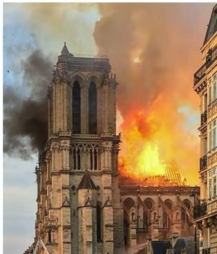
Notre Dame, Paris – 15 April 2019

We defend ourselves against the wiles of the wicked by speaking out, by speaking truthfully, and by speaking words of “choice silver” , directing them at the heart of darkness that threatens to destroy the moral order established by God.