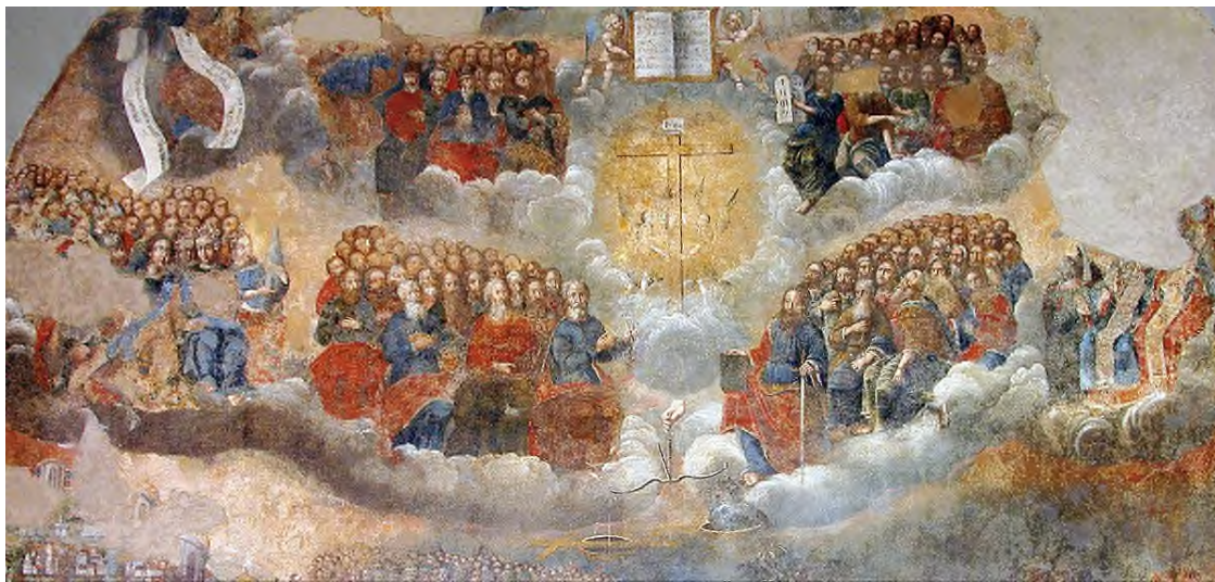
The Judgment Day [detail], 1700, fresco in Kiev.

How many of our pastors and elders contend for truth? The Word of God says “the righteous are bold as a lion” (Proverbs 28:1) , but the church today is led by pussycats. They may hiss occasionally at one of their own, but they will never dare to venture forth and contend with the wicked. It is just as the Word of God says: “When the wicked rise, men hide themselves...” (Proverbs 28:28)