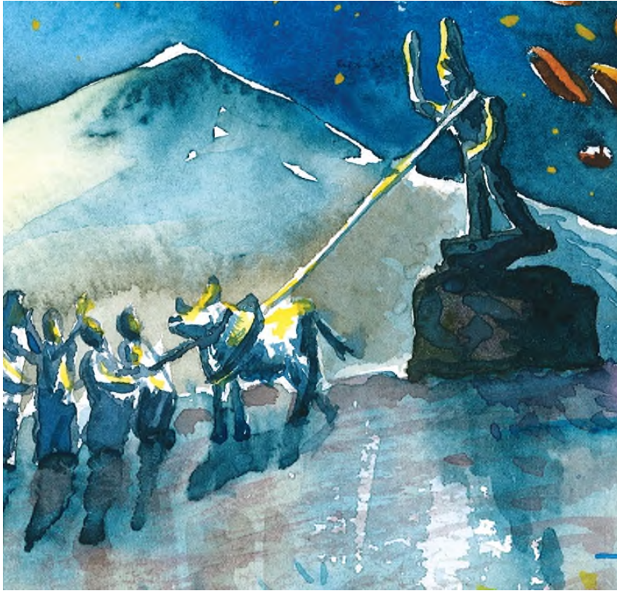
Gideon Tears Down the Altar of Baal by Andrew Lindberg

Our readers may be familiar with the expression, “Nailing your colors to the mast”. We don’t hear it used very often today and I suspect it is not well understood by the younger generation. It comes from the age of great sea battles, the period between 1550 and 1850. When a ship was attacked and overcome, the crew signalled their willingness to surrender by lowering their flag or “colors”. Otherwise the fighting would continue to the last man.