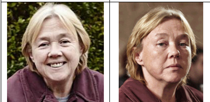
Pauline Quirke who played the role of 'Sharon'