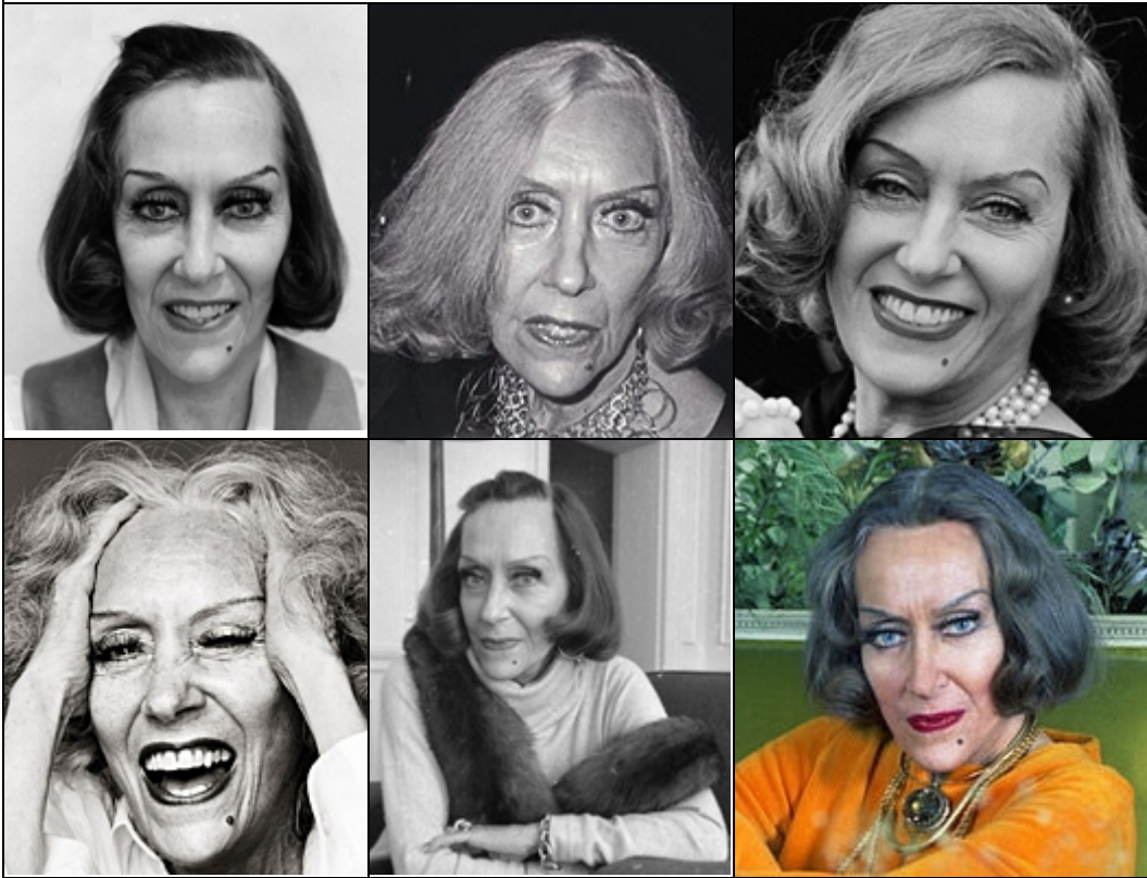
The Hollywood actress, Gloria Swanson (1899-1983)

Swanson bears an uncanny resemblance to another famous drag queen / transgender, Jerry Hall. The UK newspaper, The Sun , ran the remarkable piece about Hall on 24 February 2011 – see overleaf .