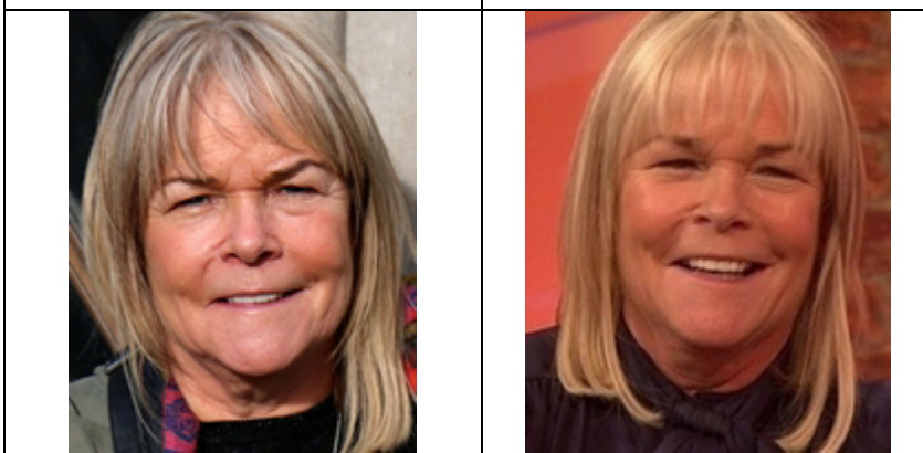
Linda Robson who played the role of 'Tracey'