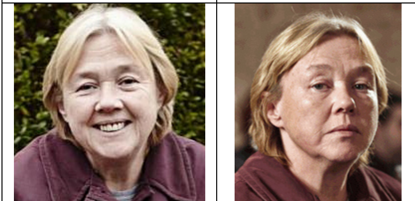
Pauline Quirke who played the role of 'Sharon'