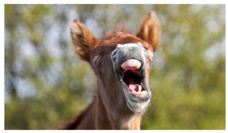
Speaking out or just yawning?