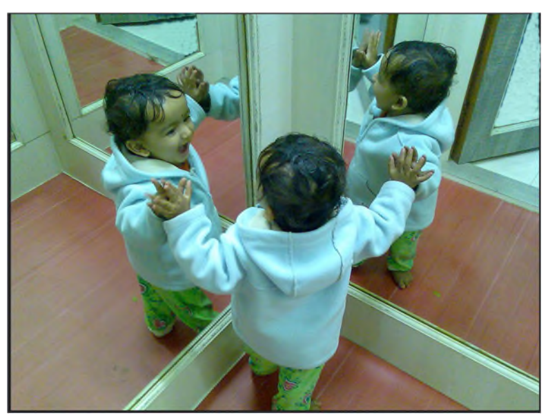
Corrupt leaders and false teachers know how to confuse and mislead the innocent.

The same dark device has been used to introduce abortion, same-sex marriage, transgenderism and many other depravities. It is used to silence dissent and bring naïve believers into line with Masonic objectives. Whether they realize it or not, pastors who use this twisted interpretation of Romans 13 are serving the Enemy. Many, in fact, are Freemasons, Marxists and Jesuit coadjutors who serve the goals of the New World Order. They deliberately dupe their flocks and instil in them a submissive attitude to matters that affect their God-given rights.