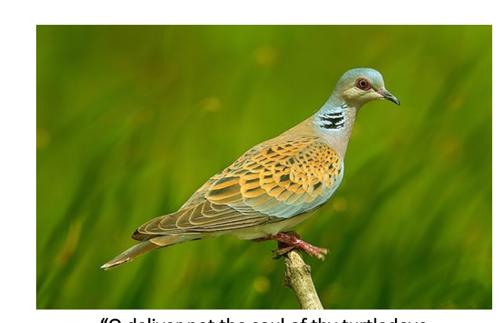
"O deliver not the soul of thy turtledove unto the multitude of the wicked:" Psalm 74:19

As we have shown in an earlier paper (#107) "the day of the Lord Jesus" (1 Corinthians 5:5 and 2 Corinthians 1:14), "the day of Jesus Christ" (Philippians 1:6) and "the day of Christ" (Philippians 1:10 and 2:16; 2 Thessalonians 2:2) ALL refer to the same prophetic occasion, the day of the Resurrection of the saints and the Rapture of the Church. They do NOT refer to the day of the LORD/Lord, which is a later, separate event known as the seven year Tribulation.