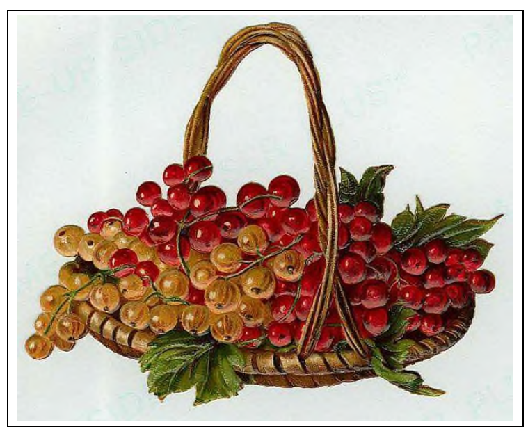
"Amos, what seest thou?" (Amos 8:2)