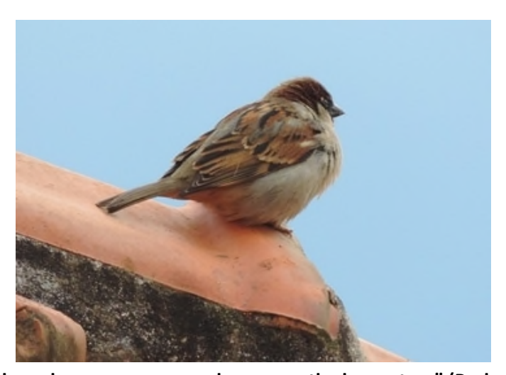
"I watch, and am as a sparrow alone upon the house top." (Psalm 102:7)

Anyone with that desire will have studied the doctrine of the Pre-Tribulation Rapture with great objectivity and care.