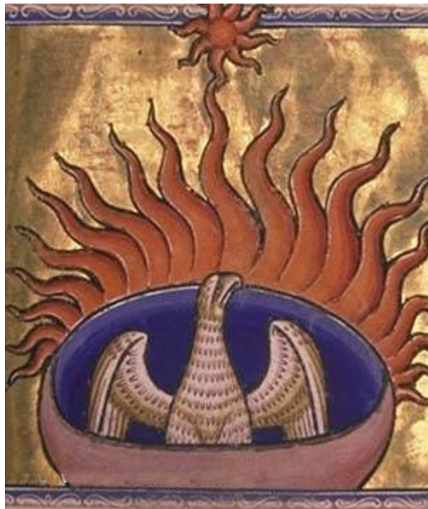
Aberdeen Bestiary Manuscript, c1200

The scaffolding even gives the dome an uncanny resemblance to the Tower of Babel, as depicted in many famous paintings.