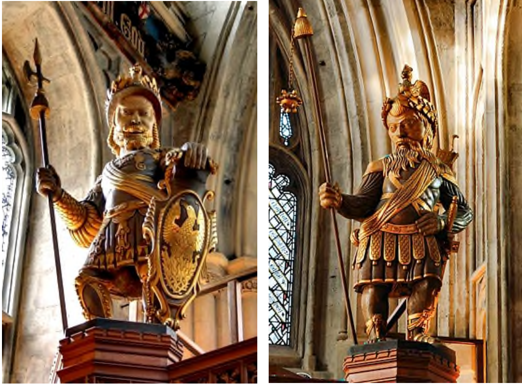
Statues of Gog and Magog at the Guildhall in the City of London

A great deal has been written about the future military invasion of Israel described in chapters 38 and 39 of the Book of Ezekiel. Despite the lengthy expository opinions expressed by dedicated scholars of Bible prophecy, there has yet to emerge a clear consensus regarding the timing and nature of the Gog-Magog incursion into the Holy Land.