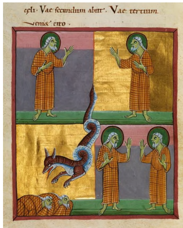
The Two Witnesses as depicted in the 11 th century Bamberg Apocalypse

Even with his extensive control over the media, details of the LORD's mighty work would be communicated widely by those among the Gog-Magog invasion force who were allowed to survive – indeed, many of them may have come to faith in Christ. Besides, vast regions of the Holy Land would be covered with the shattered remnants of their military equipment and the bodies of those slain by the furious storm of rock-hard hailstones.