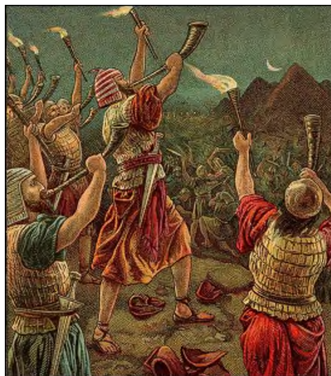
Gideon and his men

The Russians have greatly extended themselves in this campaign and become concerned by news that the “kings of the east” [China etc] are mobilising their armies. There are also reports that their supply lines to the north are set to come under attack by the Antichrist. So Gog, the king of the north, returns swiftly to the land of Israel (“the glorious land” of verse 41) and sets up his headquarters somewhere between the Mediterranean and the Dead Sea. He is now set to destroy the nation of Israel but, at this point, God intervenes. He causes the Gog-Magog armies to turn on each other. A huge deluge of rain causes all of their vehicles and equipment to sink in the mud, and massive hailstones bombard their armies with crushing effect. As verse 45 says, Gog is helpless. The Israelis didn’t have to fire a single shot in their defense. God in heaven did it all. And Gog is killed.