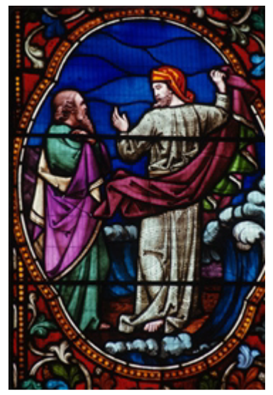
Elijah parts the Jordan.

Given the enormous spiritual importance of this event – not just for Israel but for the whole of mankind – it is significant that the Jordan was also parted on two other occasions, both on the <u>same day</u>, on the first occasion by Elijah and on the second by Elisha. In the language of the Bible, this conspicuous day would seem to be pointing to an even more momentous day sometime in the future involving these particular individuals.