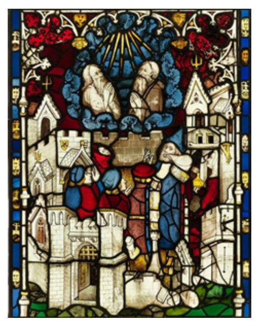
The Two Witnesses ascend into heaven.

The Two Witnesses will be reviled in the international media and their words and actions distorted in the most outrageous ways. The world will see them much like villains in a reality TV show, religious phonies whose antics both amuse and offend at the same time. As the first half of the Tribulation unfolds and the world as a whole falls more and more under the spell of the Antichrist, the Two Witnesses will be increasingly hated by almost everyone.