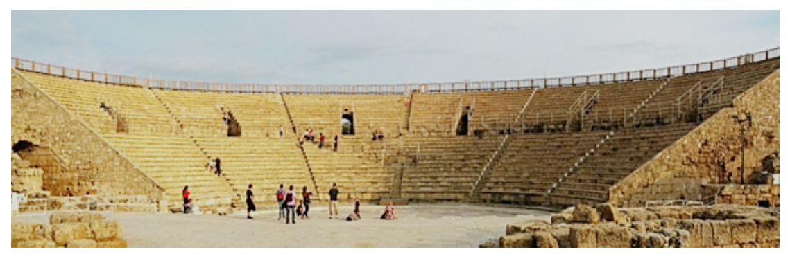
The amphitheatre at Caesarea where King Herod Agrippa was struck down by an angel of God.

When Herod Agrippa accepted the acclamation of deity, he was struck down by an angel of the LORD. As soon as the Antichrist does the same, he will commit a heinous deed which instantly destroys his holy façade. The man who, up to that point, had deceived the whole world through his false humility, his seeming piety and his supernatural charisma, is suddenly revealed for what he is, a brutal tyrant energized by Satan himself.