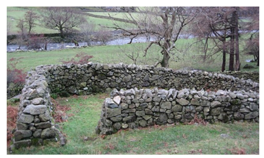
Sheepcote (N.B. Gate not in picture)

The Greek word for "hour" in verse 13 is hora (Strong's G5610). This word appears 108 times in the New Testament and is translated in the KJV as "hour" 89 times, "time" 11 times, "season" 3 times, and in other ways 5 times. It may not refer in this instance to an event taking place in the same 60 minute period, but (as we use the term today) to events in close proximity. Seen in that light, the earthquake may occur a few days after the Two Witnesses ascend into heaven, perhaps immediately after the abomination of desolation. (The 7,000 slain in the earthquake may have been soldiers of the Antichrist.)