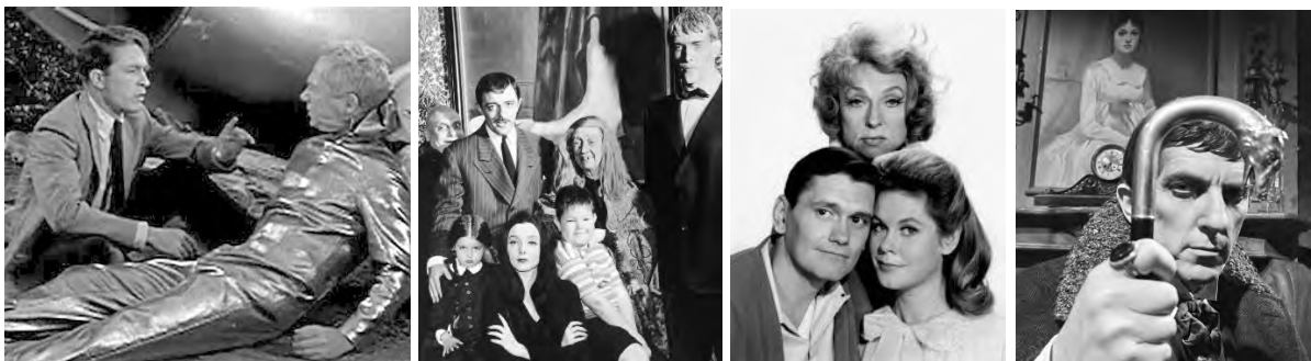
My Favorite Martian, The Addams Family, Bewitched, and Dark Shadows. The latter attracted an average of 7-9 million viewers daily .

This led to popular prime time shows based on one or more of the themes inaugurated by The Twilight Zone series, such as My Favorite Martian , The Addams Family , The Munsters , Lost in Space , The Invaders , I Dream of Jeannie , Bewitched , The Time Tunnel , Dark Shadows , and The Outer Limits . By 1969, most Americans were prepared to believe that two of their citizens had "landed" on the moon. It was nonsense, of course, but the conditioning process had worked.