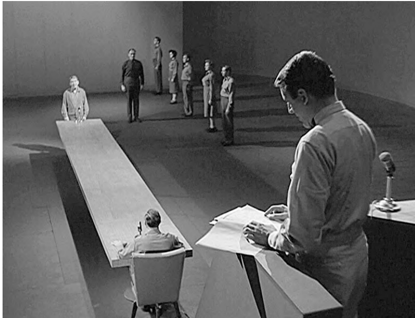
The Chancellor [right] passes judgment on Mr Wordsworth [left]

Our main purpose in writing this paper was not to discuss The Twilight Zone series per se but to draw attention to one of its 156 episodes which appeared in every way to contradict what the series was designed to achieve. The episode in question, The Obsolete Man (#29 in season two) actually turned out to be a robust defense of the Bible and a celebration Christian courage. It was a miracle that it got through.