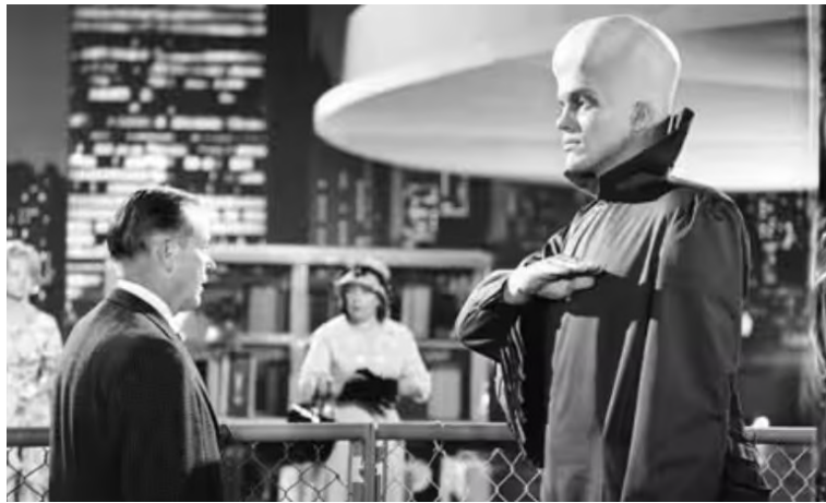
Aired March 2, 1962: episode 24 of season three.

We cannot summarize the themes dramatised over each of the five seasons but we set out in Appendix A a one-line plot summary of all 36 episodes in the First Series. Bear in mind as you read through them that most Americans at that time would never have encountered such material or been challenged to believe that it might have some validity. For example, the Bible condemns sorcery and necromancy in unequivocal terms, but viewers of The Twilight Zone were urged to look at them in a fresh light.