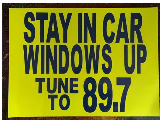
Notice on Temple Baptist Church Facebook page.