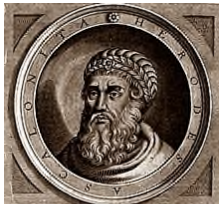
Herod the Great

Our pastors and preachers should be warning of the leaven of Herod, but they are not!