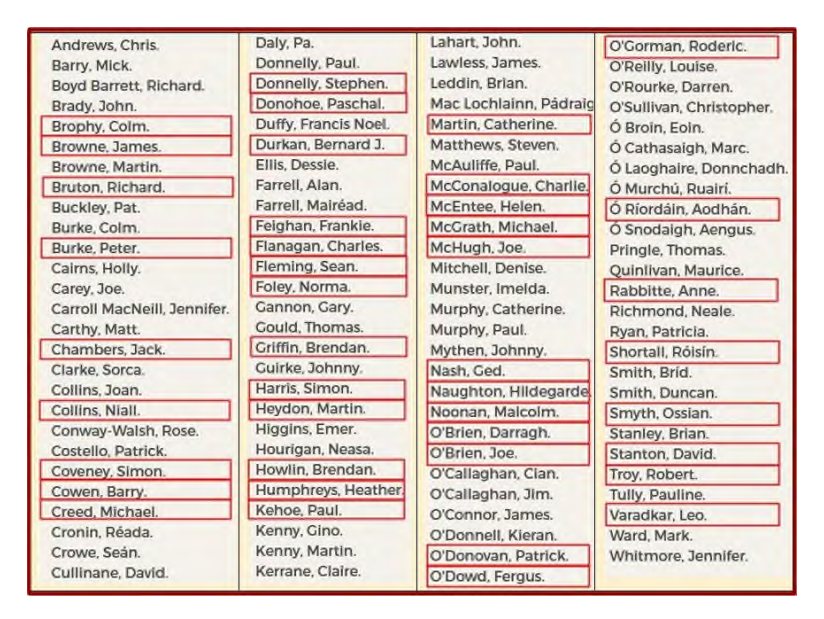
"...all they that hate me love death." (Proverbs 8:36) See Appendix A

A similar idea may be found in Genesis: "for the iniquity of the Amorites is not yet full." (Genesis 15:16). On that occasion Scripture was saying that, while the Amorites were steeped in evil, they had not quite reached the stage where God would intervene and destroy them.