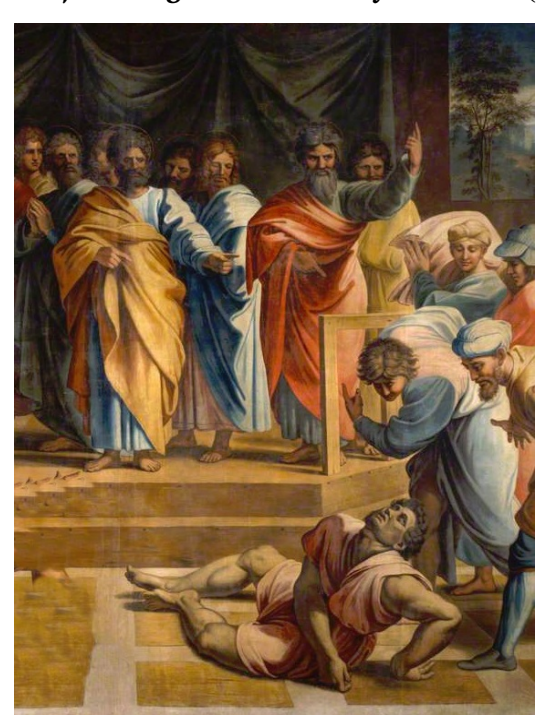
Ananias falls down dead.

"Be sober, be vigilant; because your adversary the devil, as a roaring lion, walketh about, seeking whom he may devour:" (1 Peter 5:8)