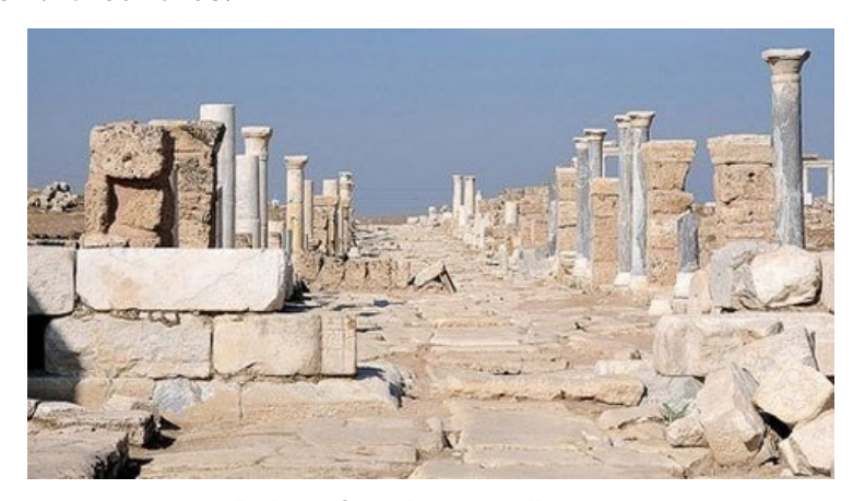
Ruins of ancient Laodicea

Christ condemned the lukewarm Laodicean church. It was lukewarm because it was neither hot nor cold. It neither loved the truth nor hated evil. That's the chief characteristic of the modern church, a complete absence of any ability to be "vexed" or upset by the "filthy" condition of the world around us.