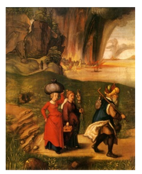
Lot and His Family Flee from Sodom by Albrecht Dürer

This should speak just as vividly and as lovingly to each of us today! While the believer is no longer under condemnation, he must live out his time here on earth under conditions which can be immensely trying. As the End Time draws closer and the tide of wickedness rises higher and higher, where men of reputation publish books that mock and defy the LORD God of the Bible, where every unseemly and salacious form of behavior is acceptable, and where the arrogance, willfulness and pride of the self-anointed Elite is painful to behold, the righteous man is greatly troubled by what he sees and by his inability to do anything about it.