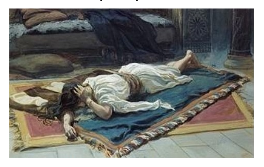
Bathsheba Mourns Her Husband by James Tissot

Despite what we may think, we have a choice. We can be miserable in face of the incredible wickedness of the world around us, or we can live daily in the joy of our salvation. Which choice have you made?