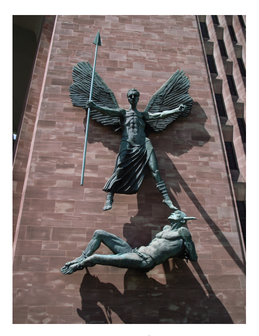
Jacob Epstein's depiction of the angel binding Satan

"And I saw an angel come down from heaven, having the key of the bottomless pit and a great chain in his hand. And he laid hold on the dragon, that old serpent, which is the Devil, and Satan, and bound him a thousand years, And cast him into the bottomless pit, and shut him up, and set a seal upon him, that he should deceive the nations no more, till the thousand years should be fulfilled: and after that he must be loosed a little season." (Revelation 20:1-3)