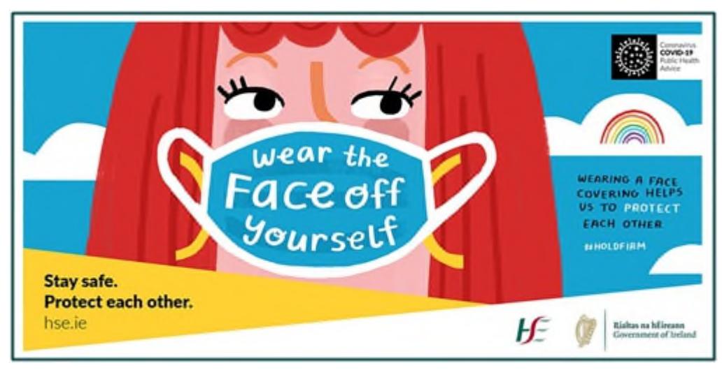
HSE ad promoting mask-wearing, with a gender-bending rainbow.

We could speculate as to the range of scientific studies that have been carried out to show that social distancing, mask-wearing, home isolation, and travel restrictions are effective, safe and reliable. But why speculate? Why not simply ask the Health Service Executive (HSE) — the organization established in law to approve and oversee all aspects of the national health strategy in Ireland — what studies it has used to confirm that it is doing what is best for the Irish people? So we asked them.