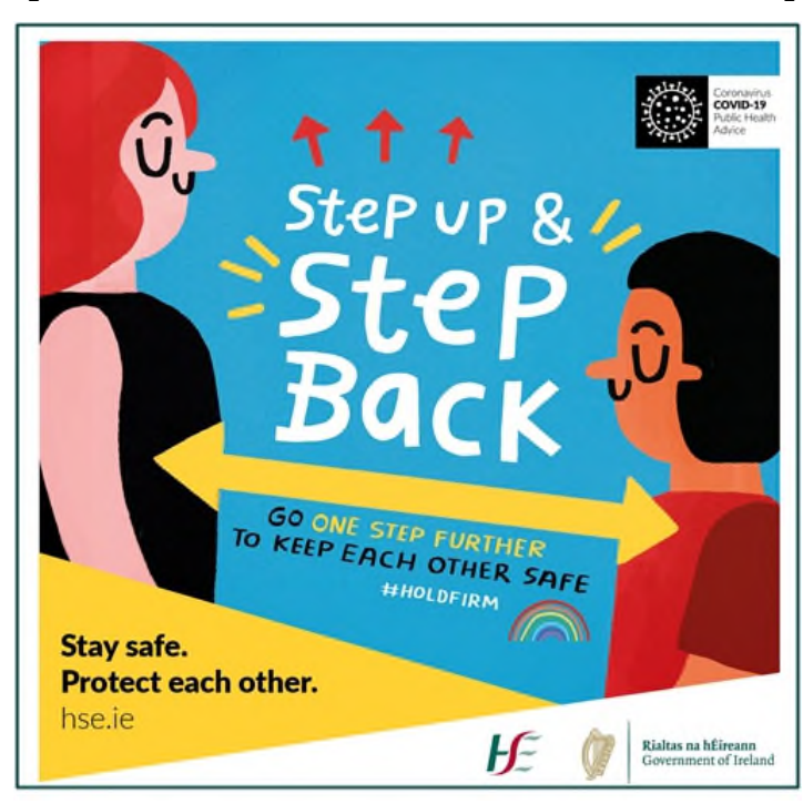
HSE ad promoting social distancing, with another gender-bending rainbow.

Please provide me with a full, accurate and complete list of records, including the date of the record, held by the HSE or under your authority, which describe the proven scientific effectiveness of masks or face-masks as a means of limiting or containing the spread of SARS-COV2 (Covid-19) or similar viral pathogens.