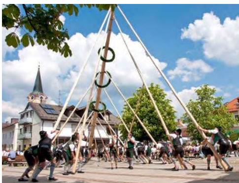
Raising the Maypole in Germany.

They pretend to be godless (when they are not pretending to be Christian), but in reality their god is Baal. Why on earth would any government erect a massive steel needle in the middle of the main thoroughfare of their capital city? Because it is a symbol, in this case a May Pole. In times past such poles were erected on the village green on 1 st May in honor of Baal. This practice goes back to ancient times and is condemned over and over again in the Bible.