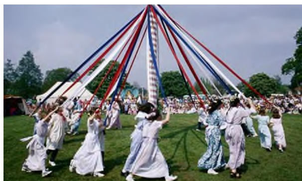
Dancing around the Maypole in England.