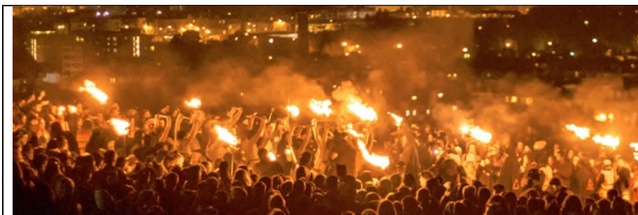
The annual Beltane Fire Festival procession around Carlton Hill, Edinburgh, 2018.

The Baal fires continued to be lit on the hills of Ireland on 30 th April/1 st May until well into the 20 th century. Many of my relatives reported seeing them in the 1950s. The month of May, in Irish, is Bealtaine or Baal tine , the Baal fires. The occult ascendancy who run the New World Order still retain some of the old Irish and Scots Gaelic terms in their esoteric vocabulary. These include Samhain (31 st October), Imbolg (2 nd February), and Lughnasa (1 st August).