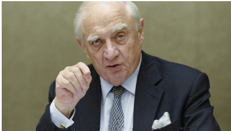
Peter Sutherland, high-profile crony of David Rockefeller

If the plain people of Ireland understood the true nature – the heart, mentality and motivation – of the politicians who rule their country, they would be aghast. Of course, they know that many of them are self-seeking wheeler-dealers who serve only vested interests, who are utterly indifferent to the common good, and who use every opportunity, whether legal or illegal, to feather their nests. The electorate tolerate this state of affairs since it seems to them to be the price that must be paid to assemble a small group of men and women “capable” of leading the country. However, if they believe that this is the complete picture, they are greatly mistaken. A complex drama is transpiring behind the scenes of which they are almost entirely unaware, a drama involving a range of factors, players and goals to which the mainstream media never alludes.