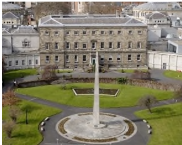
Leinster House, seat of the Irish Parliament.

Unless the Irish awaken from their prolonged hibernation and face down the treasonous cabal in Leinster House, the country their forefathers built at great personal cost will rapidly disintegrate. Their grandchildren – those who survive abortion, castration and gender confusion, poison vaccines, sexualization, sodomy, and teenage depression – will be condemned to subsist in a society scarred by ethnic tensions and cultural divisions. The communities we know today will fragment into enclaves for their own protection, living standards will fall dramatically, crime rates will soar, and the growing numbers of disaffected and disenfranchised will erode any remaining sense of national identity.