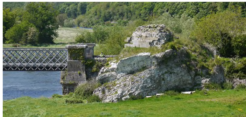
Boyne Obelisk (before and after)

Another obelisk was blown up by an unknown group on 11 November 1933. Located on Bray Head in County Wicklow, it overlooked the seaside town of Greystones, a bastion of Freemasonry on the east coast. The group who blew it up were familiar with the inner workings of Freemasonry since they had chosen an unusually significant date to carry out their deed – November 11 th , 1933.