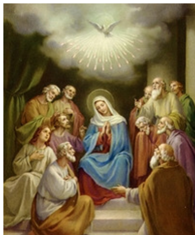
Roman Catholic goddess worship

Not only is this so-called justification both shameless and hollow, it is dangerously unscriptural since the indwelling of the Holy Spirit, which commences when we are born again, does not ‘divinize’ us or turn us into gods. The idea that man can be ‘divinized’ is heresy of the worst kind and a core tenet of New Age gnosticism.