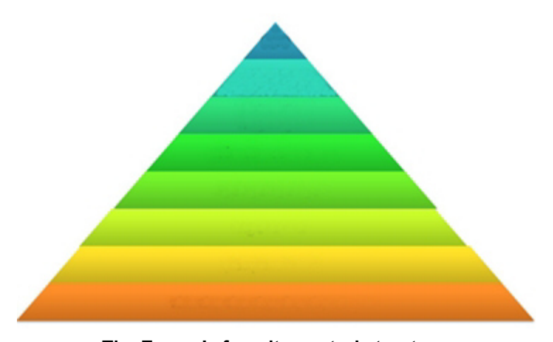
The Enemy's favorite control structure.

By formulating strategies to make the world a better place and bring in the kingdom, Dominionists are obliged to make use of hierarchical systems. Goals are set and tasks are assigned, both to individuals and to groups. The most 'anointed' or 'spirit-filled' individuals assume leadership positions, make plans, and delegate responsibilities. This requires central and regional planning, along with target-setting at a local level.