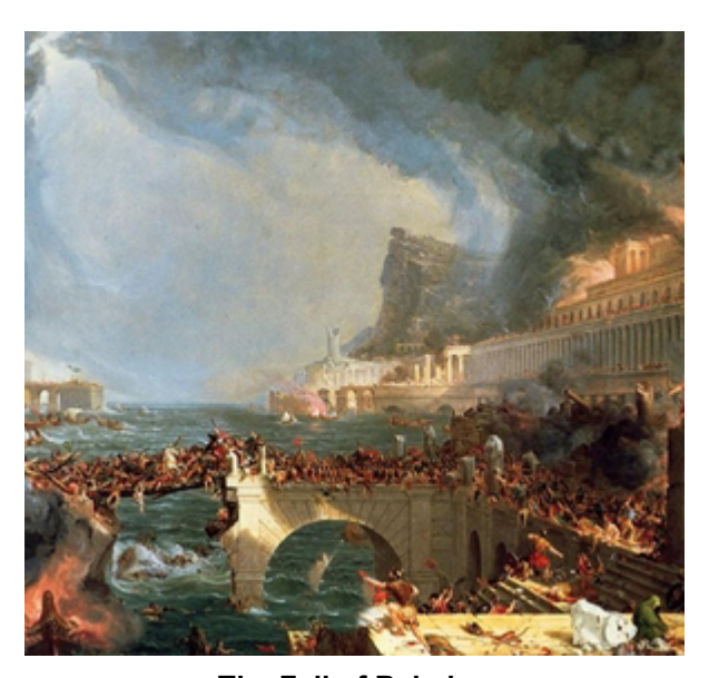
The Fall of Babylon

This doctrine is not just a poor interpretation of God's Word, but a blatantly false one, a teaching that has dire implications for the future of mankind.