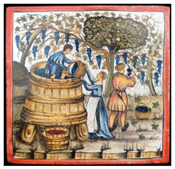
Treading the winepress ("winefat" in KJV)

It is hardly any wonder that the Babylonian Elite, the rulers of the fourth kingdom, are anxious to deflect attention from these and similar prophetic passages. They try to allegorize Bible prophecy relating to the End Time and devise interpretations that run counter to what the Bible plainly states.