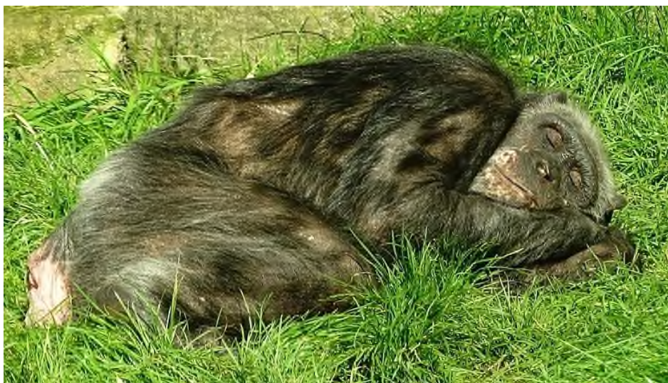
The vibrant church of Laodicea.