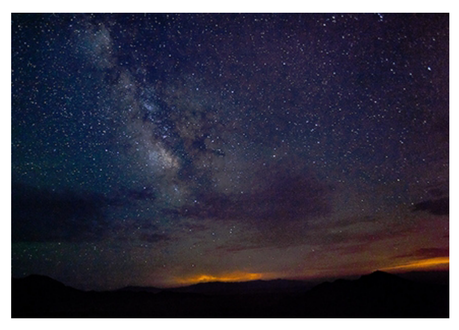
Starry sky over the Mojave Desert, 9 July 2011

For anyone who has not had a proper view of the night sky, especially as it progresses from dusk to dawn, the photos in Appendix A should prove helpful. As impressive as they are, however, they do not come close to capturing the stunning immensity of the real thing, the variety and brilliance of the colors, or the extraordinary effect that it has on the viewer, both physically and spiritually.