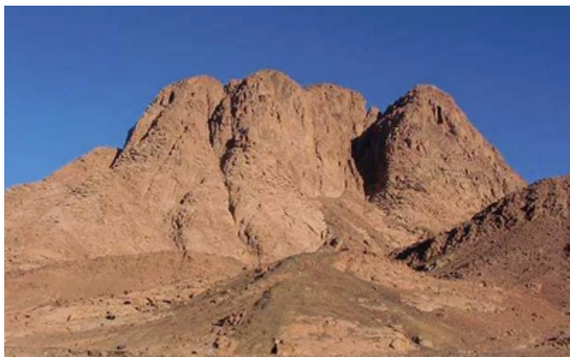
Modern Mount Sinai. [Believed by many to be the Biblical Mount Sinai.]

This did not mean, of course, that a righteous and God-fearing person could drift into sin. After he is born again, the believer lives in accordance with the law written in his heart – " This is the covenant that I will make with them after those days, saith the Lord, I will put my laws into their hearts, and in their minds will I write them; " (Hebrews 10:16). He knows, through his conscience and the prompting of the Holy Spirit dwelling within him, when he is acting contrary to God's will.