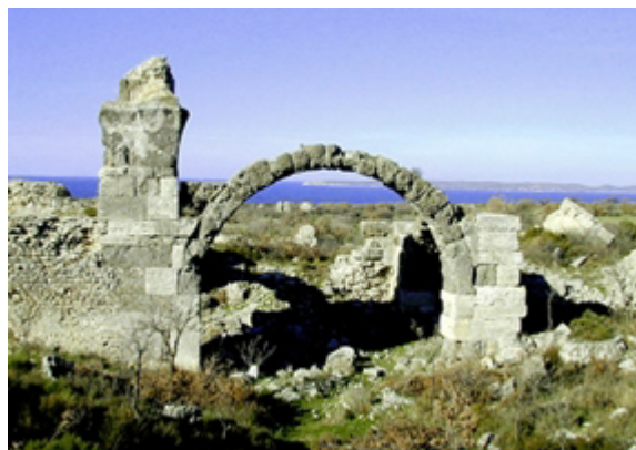
Ruins at Troas dating from 2 nd century AD.

"And we sailed away from Philippi after the days of unleavened bread, and came unto them to Troas in five days; where we abode seven days. And upon the first day of the week, when the disciples came together to break bread, Paul preached unto them, ready to depart on the morrow; and continued his speech until midnight."