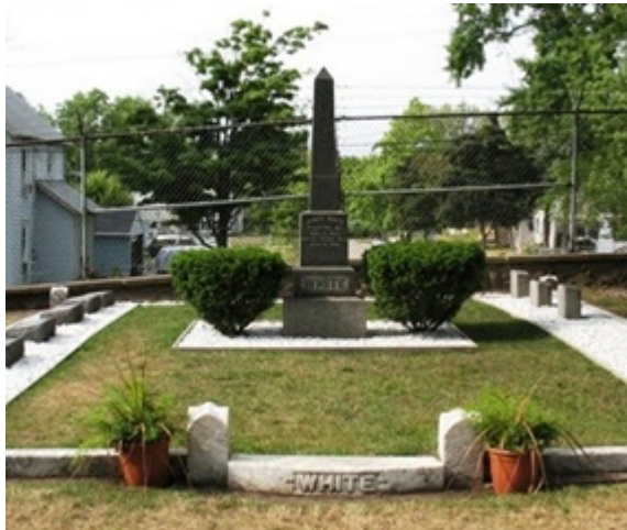
Masonic obelisk on the grave of Ellen G White.

White tried to convince her people that Christians should observe the Sabbath and forget the Lord's Day. She went so far as to claim that by observing the Lord's Day, a Christian was falling into Satan's trap. She reasoned that the Roman Catholic Church was "the beast" and that Sunday observance would become the principal sign or "mark" of loyal participation in the "beast" system.