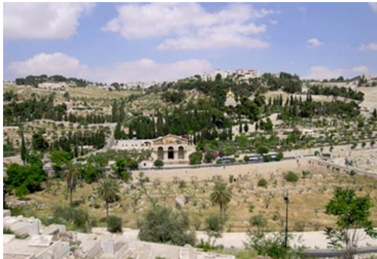
Mount of Olives

1. Propitiation: This is the English translation of the Greek word hilasterion , which in turn is a translation of the Hebrew word kapporeth , meaning "mercy seat." The mercy seat, which covered the Ark, was made of a single piece of pure gold. It represented Christ as the perfect protective covering ( kapporeth ) that shielded fallen man from the righteous wrath of God. The shed blood of Christ covers the sin of all mankind, and does so completely and perfectly. It is thus the kapporeth or propitiation for that sin, making full and final payment for it. In a single sacrifice, never to be repeated, his shed blood satisfied in full, once and for all, the unalterable demand by a holy and righteous God that every sin be punished, without exception. Propitiation in a Biblical sense is entirely a work of mercy and grace which both vindicates the righteousness of God and reconciles man with God. Through it the Father is saying, This is what your sin cost me, and I bore that cost in full in my Son. [Some Bible translations use the word 'expiation' instead of propitiation, but this is wrong. The word propitiation necessarily implies the objective settling of an account, while expiation does not.]