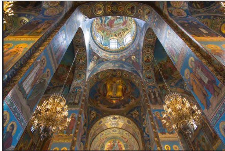
St Isaac's Cathedral, St Petersburg

The veil obscuring their proper understanding of the Old Testament will not be taken away until, as a nation, they accept Jesus Christ as the Messiah. This awful obscuration has persisted for nearly two thousand years, causing them to miss the most obvious statements of truth in God's Word. For example, the rabbis who maintain that Scripture does not countenance the establishment of the state of Israel before the return of the Messiah would appear to be blind to the passages in the prophetic book of Zechariah which say otherwise.