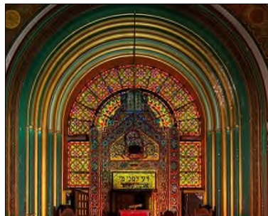
Interior of Agudas Achim synagogue in Chicago, now abandoned.

The first quotation refers to the “three oaths” (highlighted). According to the Talmud these were prohibitions imposed by God on mankind, two of which pertained to the Jewish people and one to the nations of the world. They were called “oaths” as men were expected to swear to uphold them. Under these oaths the Jews were not to forcefully reclaim the land of Israel and not to rebel against other nations, while the nations were not to subjugate or oppress the Jews.