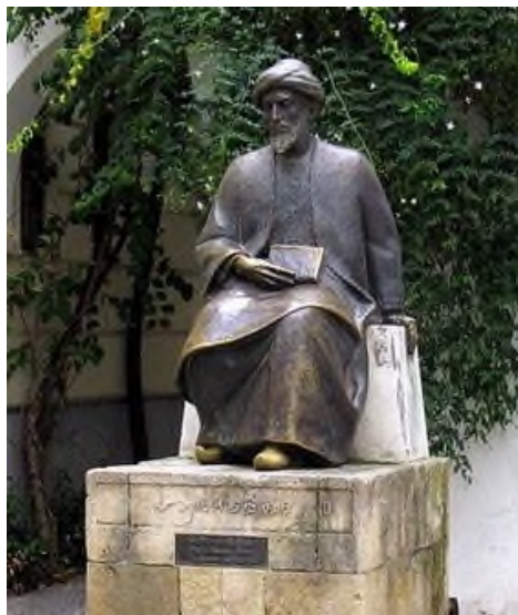
Statue of Maimonides in Cordoba, Spain

“The term Torah is also used to designate the entire Hebrew Bible. Since for some Jews the laws and customs passed down through oral traditions are part and parcel of God’s revelation to Moses and constitute the “oral Torah.” Torah is also understood to include both the Oral Law and the Written Law.”