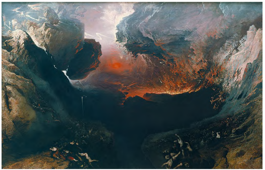
The Great Day of His Wrath by John Martin (c.1851)

"Not forsaking the assembling of ourselves together, as the manner of some is; but exhorting one another: and so much the more, as ye see the day approaching" (Hebrews 10:25)