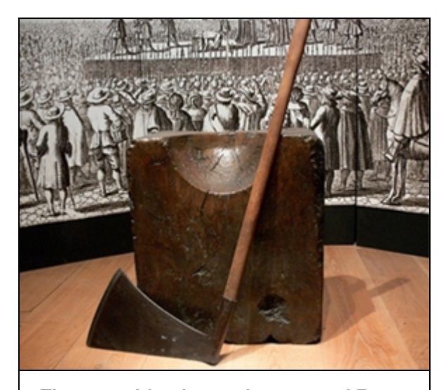
The reward for those who opposed Rome and gave the Bible to the common people.

So what is going on? Are we being deceived? Of course we are! The Enemy is systematically degrading the Bible. This process began in earnest in the second half of the 19<sup>th</sup> century, mainly in England and Germany, and has been gathering pace ever since. As a result, we now have pastors and preachers in Christian communities around the world who quote copiously from a manmade paraphrase of the Bible, known as The Message , and treat it as though it was the Word of God.