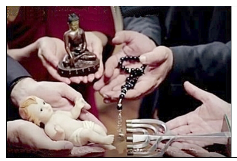
A statue of the Buddha and a Muslim rosary are displayed in ecumenical solidarity in the Pope's interfaith video, January 2016.

Satan and his servants had been careless. They had underestimated the revolutionary potential of the printing press. Within a few short years tens of thousands of copies of the Bible had been printed and quietly distributed to all parts of Europe. The real power of the Reformation lay in this devastating proclamation of God's Word. As men read it for themselves and felt the stirring of the Holy Spirit within their breasts, they burst forth into a whole new expression of truth and spirituality.