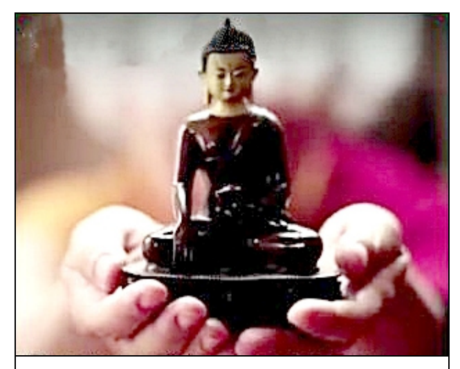
A statue of the Buddha is reverently held aloft in the Pope's inter-faith video, January 2016

True Christian prayer is a deadly weapon and Satan hates it. He knows that even the lowliest believer can do real harm to his cause through genuine Christian prayer. A sickly and bedridden woman, greatly weakened by advanced age, can, through contrite and heartfelt prayer, do much to impede the works of darkness. She does not need 'techniques' or 'attentiveness' or 'centering prayer' or any of that garbage. She simply comes before God with her petition in the name of Jesus. She does not empty her mind but, rather, fills it with God's Word. And she does not rely for a moment on what little strength she has but, like a little child, depends entirely on the Almighty to fulfill her request.