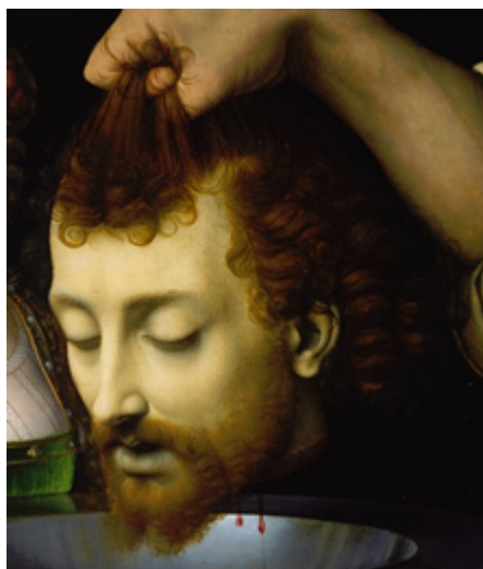
Salome with the Head of St John the Baptist by Andrea Solario [detail]

We can see, therefore, how any major international political event scheduled for that date would likely have an important role in the Illuminati plan for World Government. Since the referendum to decide whether or not the UK will leave the European Union (the 'British Exit' or Brexit ) is scheduled for June 23 rd – St John's Eve – and the result will become known on St John's Day, there is good reason to believe that this event has been deliberately designed to trigger the crisis which the Queen 'approved' on the same date the previous year. The UK decision to leave may light the fuse that destroys the already tottering Deutsche Bank – the backbone of the German economy. Thus we can see why Mrs Merkel had to be involved, as principal representative of the German people and ultimate guarantor of decisions affecting the German banking system.