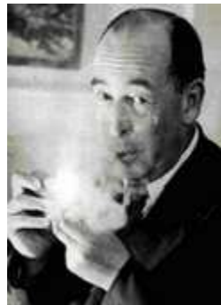
C S Lewis

His sweeping dismissal of Biblical prophecy is almost triumphant in tone.