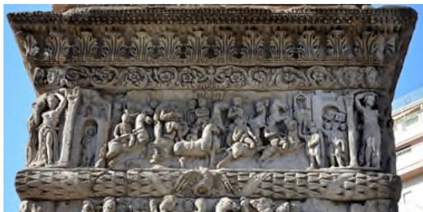
Relief scenes on the Arch of Galerius, Thessalonica

A watchman ministry must try to expose these lies in their various shapes and sizes. We must do this without resorting to speculation, keeping as close to the facts as we can and continually measuring everything we find against God’s Word.