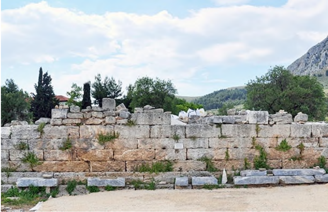
The Bema at Corinth where Paul stood before Gallio.

Regular readers may wonder about my ministry. It is that of a watchman, of course, but how do I perceive the role myself?