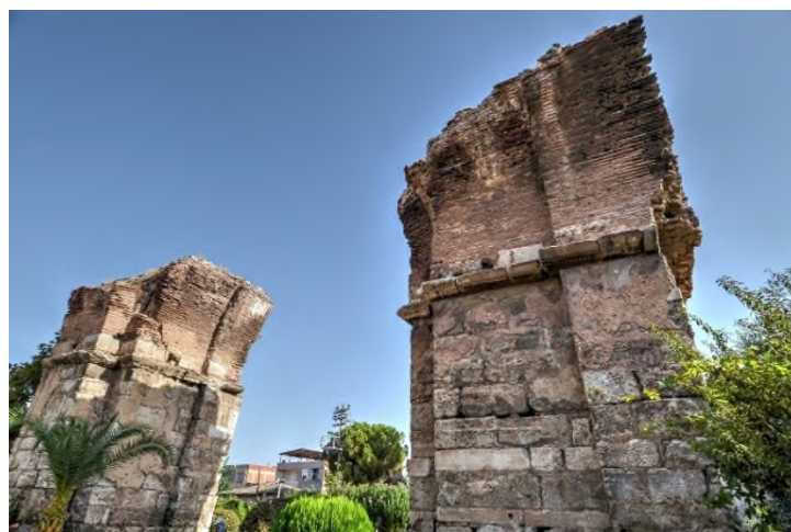
Ruined columns of the church of St John in Philadelphia, built in the 6 th century.

“Because thou hast kept the word of my patience, I also will keep thee from the hour of temptation, which shall come upon all the world, to try them that dwell upon the earth. Behold, I come quickly: hold that fast which thou hast, that no man take thy crown.” (Revelation 3:10-11)