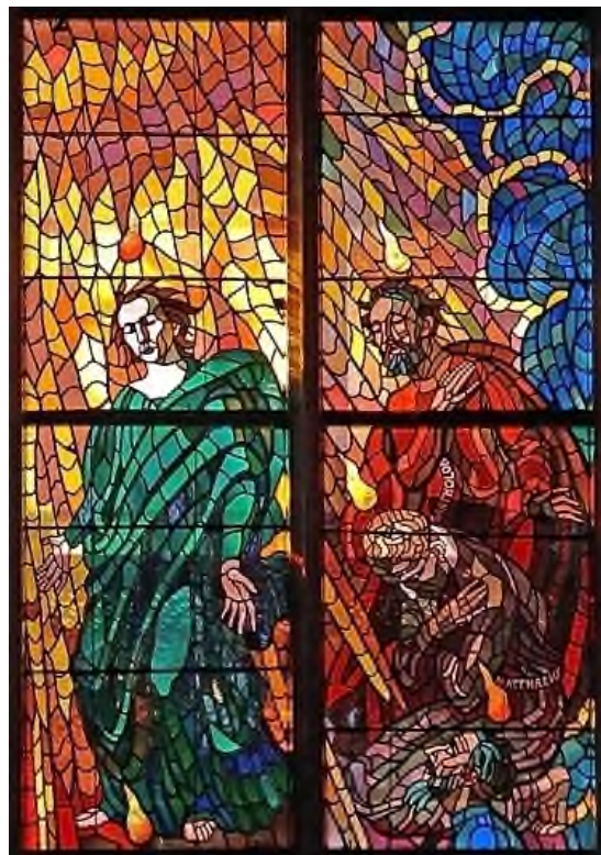
'Pentecost' [detail] St Vitus Cathedral, Prague

In what way can their resurrection be “better”? Only in the sense that they might receive a greater reward at the Bema.