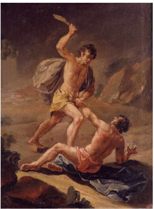
Cain Killing Abel

This is an astonishing power to grant anyone. Even if all the facts in relation to a case were subsequently brought into the public arena, there would be no way to challenge or verify any of the evidence presented by the state. Its version of events would carry the day in a court of law, assuming it is even possible under this Act – this assassin's charter – to prosecute the state for its possible abuse of the legislation. Remember, no crime has been committed. The conduct authorized was lawful for all purposes. The best one could hope for is a judicial review of the procedures followed in a given instance. If successful, one or two civil servants in Whitehall might be told to tighten up their procedures, but the matter would end there.