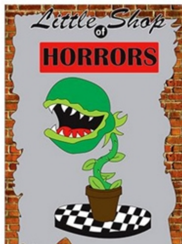
Graphic on Jesuit website.

"In this musical update of the Faust story, a nerd who works in a Skid row flower shop makes a bargain with the devil in the form of a cannibalistic talking plant named Audrey II that promises him success, both financial and romantic. All the plant asks in return is the occasional fresh corpse."