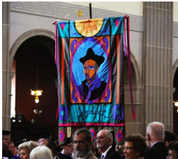
Procession honoring Jesuit founder, Ignatius Loyola

This entire 'reinterpretation' of an important passage of Scripture is simply absurd. It flaunts every principle of responsible exegesis and plays fast and loose with the text, twisting it in ways that make one question the author's sanity. He is obviously pursuing a personal agenda and has no qualms about using blasphemous innuendo to make his case. He implies that Jesus was a homosexual, that he had predatory inclinations, and that his supernatural power may have been suspect. The Jesus he portrays is that of 'queer theology', the terms used by the LGBTQ community to describe their method of interpretation. He even perverts the spiritual purpose of the passage when he replaces faith in Christ with faith in oneself. In doing so he makes a complete mockery of what the Holy Spirit is teaching through these verses.