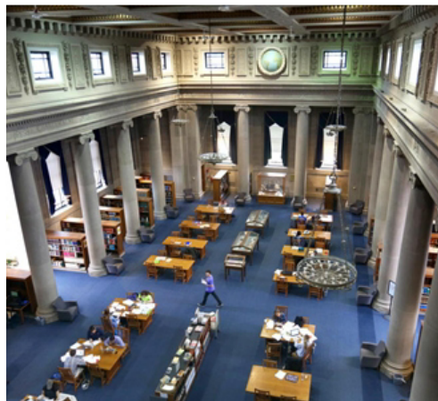
Library at the College of the Holy Cross

"His fear of losing his beloved to Jesus and hence his reluctance to have Jesus enter his house are entirely understandable in the context of his own understanding of authority...The centurion's new patron (Jesus) has the authority to tell him, as a client, what to do, and to order the centurion's subordinates (including his beloved) to come to Jesus and abandon the centurion." [p.485]