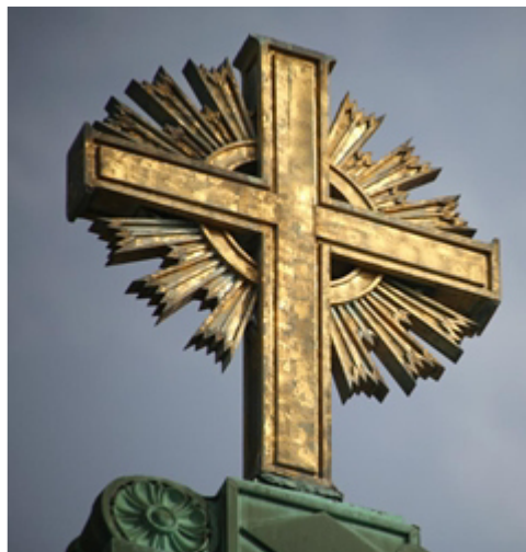
Solar cross on the College website and building. The sun-burst is one of the principal Illuminati symbols of their god.

This is exactly what the New World Order wants, open-minded, inquisitive truth-seekers, global citizens who have been set free from the prejudice and bias of Biblical truth.