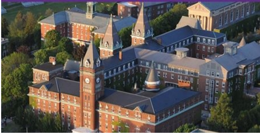
College of the Holy Cross, Worcester, MA

We have long contended that the 'Society of Jesus', known as the Jesuits, a Roman Catholic priestly order, is devoted to the destruction of Biblical Christianity and the creation of a New World Order.