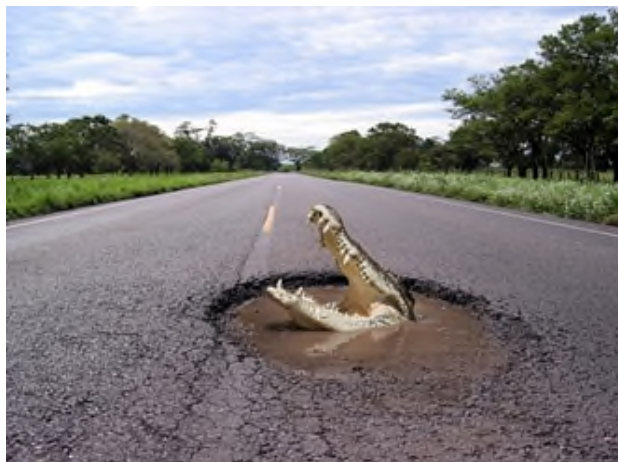
Leviathan can pop up anywhere... Just keep driving!

If the Christians in Europe and America today could look at the world through the eyes of their believing grandparents, they would be horrified at how easily the Enemy has deceived them. “Lockdown, Schlockdown!” they would have exclaimed. “What idiocy is this? You sit at home all day and let your beautiful country go to wrack and ruin – why? Because some goosey-lucifer shouts The sky is falling! Are you insane! Are you completely out of your mind?” Or words to that effect.