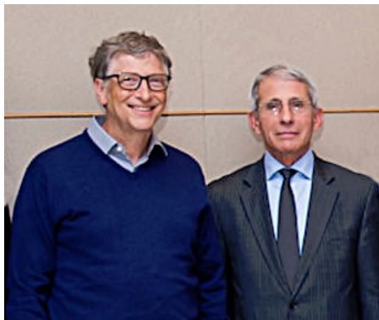
Gates and Fauci

“The man that wandereth out of the way of understanding shall remain in the congregation of the dead.” (Proverbs 21:16)