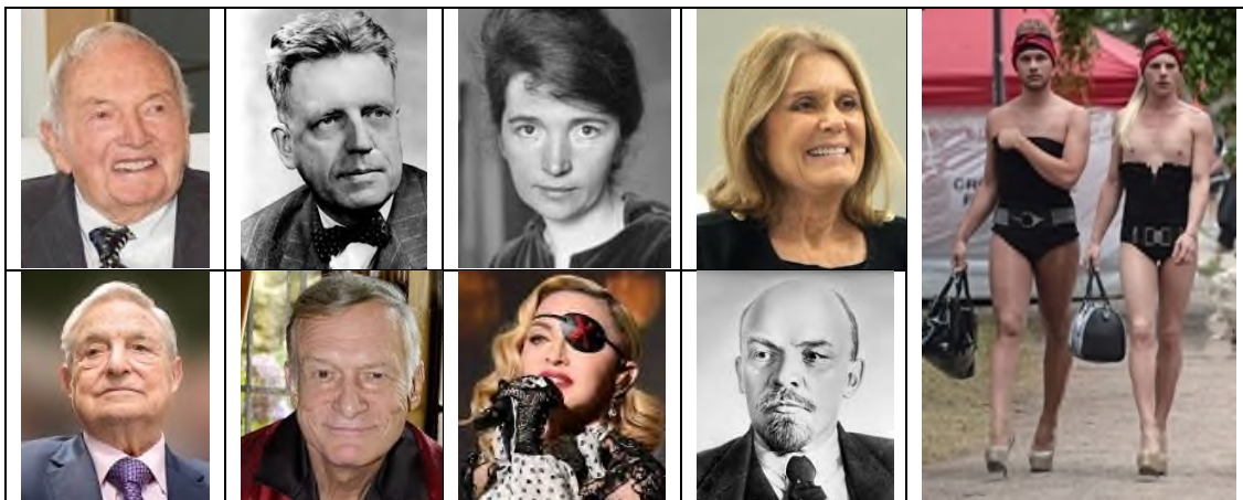
Some of the architects of the New Morality.

Several of the main political parties are openly socialist, with a strong Marxist pedigree – Sinn Féin, Labour, Solidarity, Independents4Change, Social Democrats – and thus ardent promoters of the ultra-liberal agenda. Between them they hold about 37 seats in the Dáil (22%). However, unknown to the general public, the other two main parties – Fine Gael and Fianna Fáil – are equally ardent supporters of the same liberal agenda. Between them they hold 91 seats (55%). Ironically, they like to describe themselves as ‘conservative’ and ‘centrist’ in their respective ideologies, but in practice they have entirely abandoned the values espoused by the older generation of Irish voters.