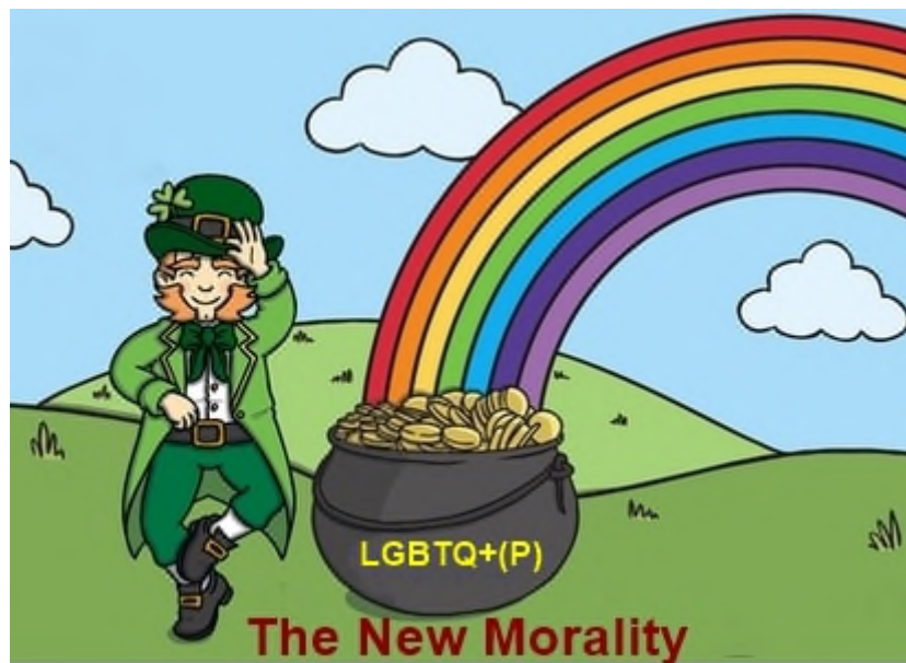
Irish politician turns sodomy into gold.

For many decades Ireland has operated an effective brand of censorship through its oppressive laws on libel and slander. These were designed to shield the conduct of the rich and powerful from fair and warranted comment. Countless politicians, whose knavery was common knowledge, would swiftly silence their critics with the threat of a defamation suit. The coterie of privileged insiders could then dance a merry dance around the plain people of Ireland, secure in the knowledge that no-one could afford to challenge or expose their underhanded schemes.