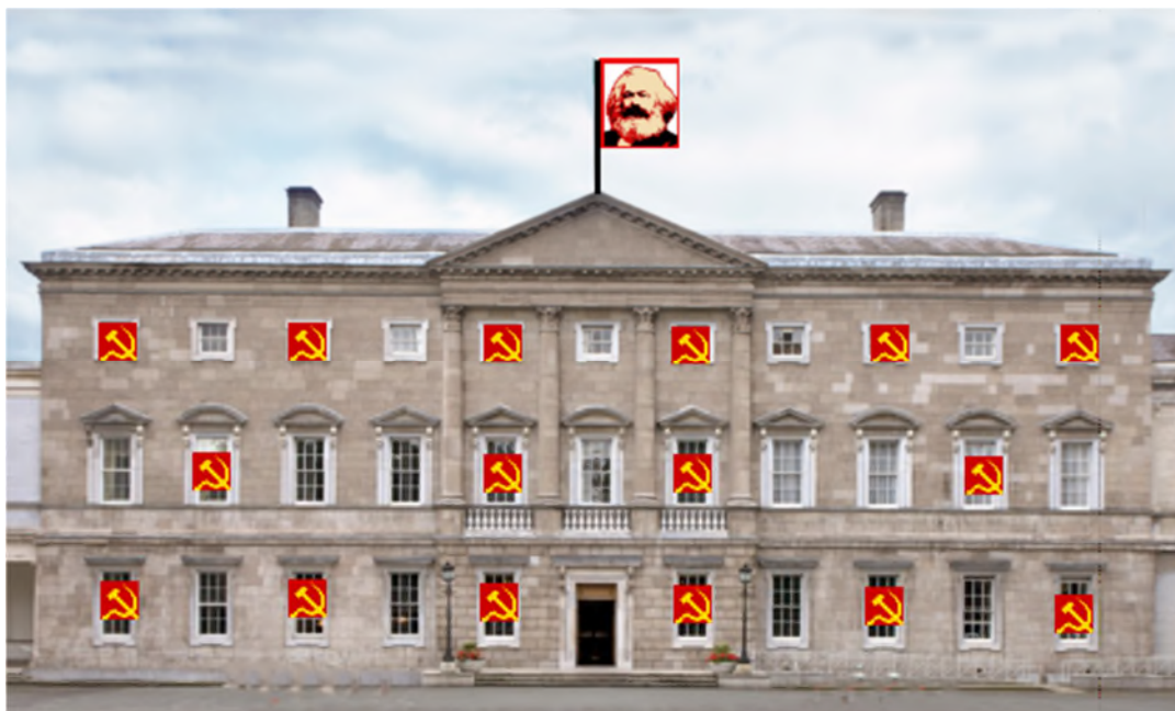
Leinster House Parliament Building – New Headquarters of Irish Marxism

This is simply unbelievable. The regime behind this appalling abuse of power is revealing its true Marxist credentials. Journalistic reporting and public discourse in Ireland are already mired in a sewer of Communist propaganda, but now the regime is going a step further and using Communist methods of control and oppression to enforce their ideology. They are even introducing, under this proposed legislation, a Stasi-style system of surveillance where disaffected citizens will be able spy on their neighbours and report them to the police.