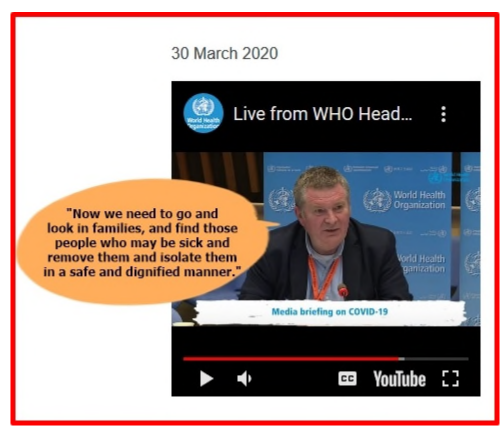
The World Health Organisation threatens our families.

Not one person in the Dail on 19<sup>th</sup> or 26<sup>th</sup> March questioned the highly dubious medical arguments on which the government has based its policy. At no stage has the WHO come forward with verifiable proof that a virus known as Covid-19 is the sole or major cause of the symptoms ascribed to it. Neither has it shown that the test for Covid-19 is reliable or why a virus in the Coronavirus group – the same group as the virus that causes the common cold! – could possibly produce symptoms that are utterly different from the symptoms which are typical of that group. There is also compelling evidence that the mortality count for Covid-19 is being inflated by the inclusion of cases where Covid-19 was not the cause of death. This would seem to pertain, in particular, to cases involving pneumonia or seasonal flu.