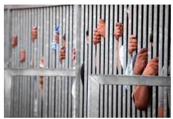
These prisoners are violating the lockdown by not standing at least 6 feet apart.

We will return to this question when we are reviewing provisions of particular concern in this "unprecedented" and "draconian" legislation.