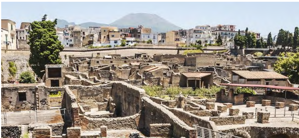
The ruins of Herculaneum in the shadow of Mount Vesuvius in Italy. The neighborhood of Herculaneum was preserved under thousands of tonnes of volcanic ash when the volcano erupted violently in 79 AD.

Before we examine how this might be possible, we would note that the Word of God appears to suggest that these phenomena, in the End Time, are influenced in some way by man. Given that wars, pestilence and famine are all manmade or result largely from deliberate policies adopted and carried out by world leaders, we can infer that the “ earthquakes in divers places ” to which the Bible refers will also involve significant human involvement.