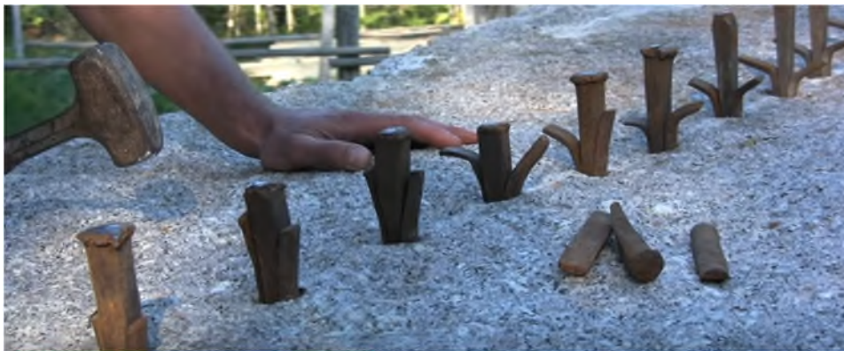
Close-up of wedges and shims being hammered into place.

https://www.youtube.com/watch?v=B7R-DW9tQSw&t=2s