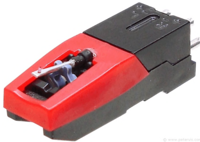
Piezoelectric ceramic cartridge with a sapphire stylus, still in use today.

The early type of stylus was fairly primitive, sending vibrations from the stylus into a magnet which converted the vibrations into an electrical impulse. In the 1930s the piezoelectric effect was used instead. This was much more sensitive and precise, giving better sound quality. It worked by exploiting a remarkable feature in the crystalline structure of the diamond, where pressure in the crystal produced a small electrical pulse . This was then amplified to produce audible output.