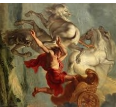
Two views of Jan Van Eyck, The Fall of Phaeton, 1636-38. Museo del Prado, Madrid.