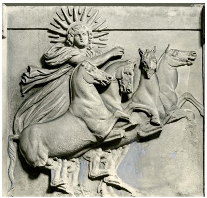
Helios (Apollo) in his chariot, a relief sculpture excavated at Troy, 1872 (in a museum in Berlin).