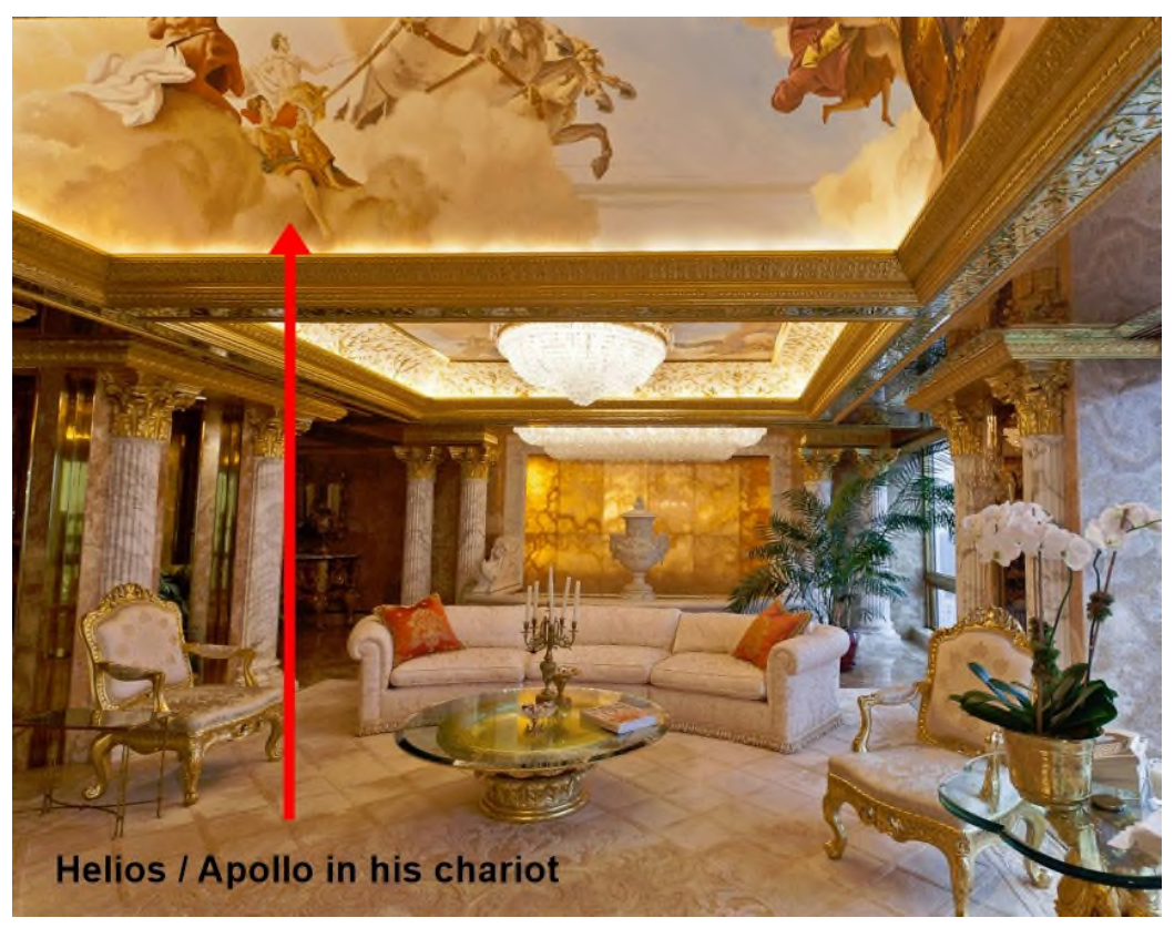
The Trump penthouse on Fifth Avenue

Once again, we have Apollo (or Helios) the sun god, in his four-horse chariot, riding across the sky: