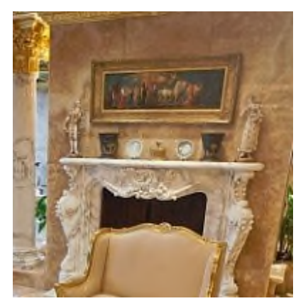
Painting of the sun god Apollo/Helios in Trump's 5th Avenue penthouse

Freemasonry is essentially a solar cult, where Apollo-Helios-Osiris is revered as the most perfect expression or embodiment of the so-called Light-Giver, Lucifer.