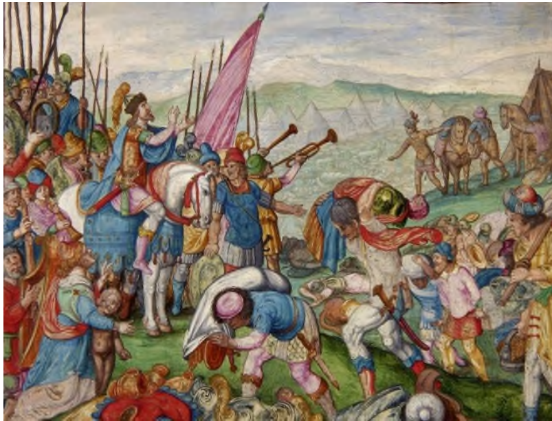
The LORD destroyed the pagan armies in the wilderness of Tekoa.

Americans have long believed that the security of their nation depends in no small measure on the Second Amendment, namely their right to keep and bear arms. There is no doubt that this has proven to be a sensible provision and has hampered attempts to date to destabilize their nation. However the need to defend and retain the Second Amendment may have blinded many Americans to their only true source of protection – their trust in the LORD God of Abraham, Isaac and Jacob, and their personal relationship with His Son, Jesus Christ of Nazareth.