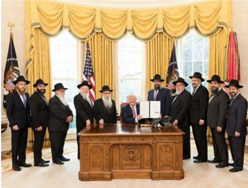
President Trump with the Chabad rabbis, 28 March 2018.