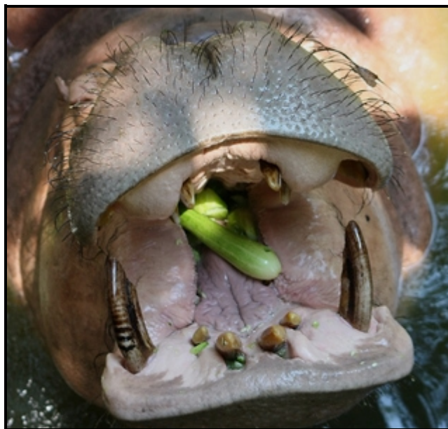
Rome's insatiable appetite.

Note the visible test that Rome is using to measure the success of her Ecumenical campaign. It is very similar to the ritual that the Emperor of ancient Rome had used to test the fidelity of his subjects. As Pontifex Maximus, the supreme head of all pagan religions, he demanded that all of his subjects publicly acknowledge his divine status at least once a year by eating food sacrificed in his name. For a long time the Jews got around this by making a sacrifice, not in his name, but for his name, a compromise that suited the Roman authorities. However, Christians were not given this option and when they refused to eat meat sacrificed in the Emperor's name, they were executed.