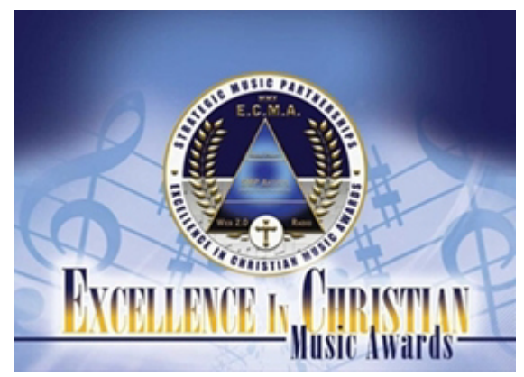
The Enemy uses his 'eye-in-the-pyramid' symbol to show he's in control

Christians who truly loves the LORD should be deeply concerned that CCM has disguised itself as 'worship music' and taken over the church. It is nothing but a soufflé of Biblical words and soft rock – feel-good entertainment with no connection whatever to true Christian worship.