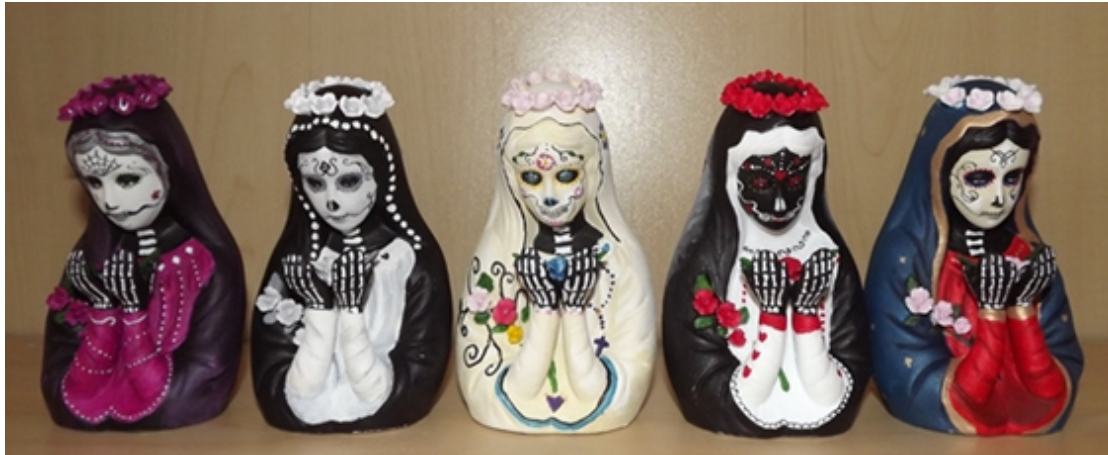
Santa Muerte statues

The bodies in some of the mass graves uncovered in Mexico reveal that the victims had either been tortured or burned alive. The heinous nature of these crimes is a clear indication that a powerful demonic force has been unleashed in Mexico. Given the respect that many Mexicans have for Santa Muerte , Santeria and other forms of black magic, this sadistic supernatural force will continue to demand more and more innocent human blood.