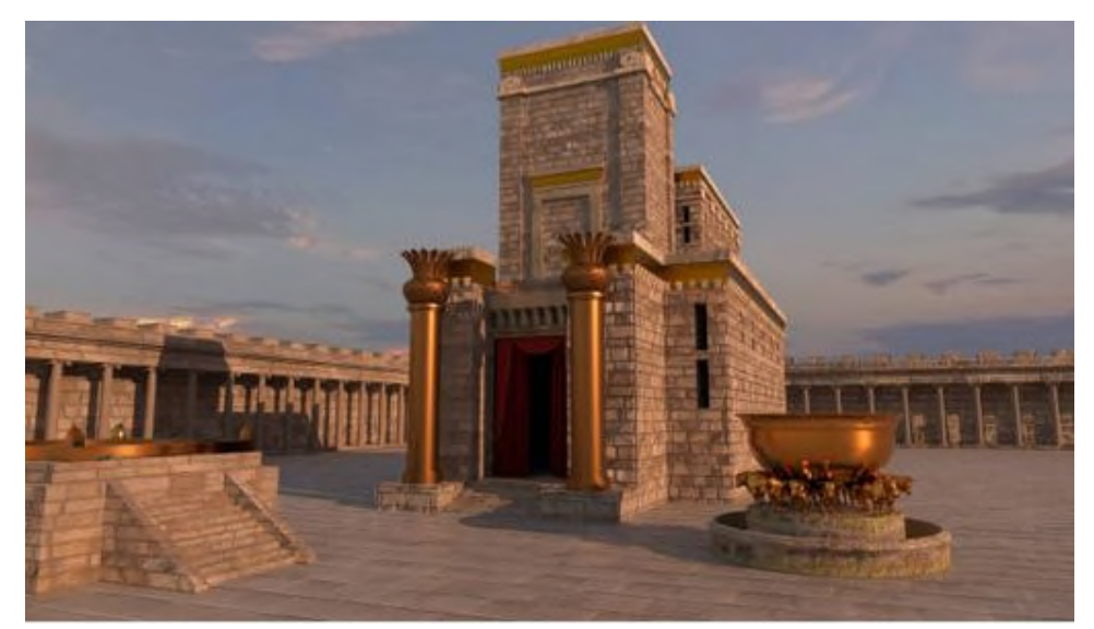
Artist representation of Solomon's Temple.

A plausible sign of this "strong delusion" will be the importance attached by nominal Christians to the construction of the Third Temple in Jerusalem. Many who will end up receiving the mark of the beast will believe that the Third Temple had been constructed by well-intentioned men to honor the LORD God of the Bible. In reality it will be constructed by Freemasons and apostate, Cabalistic Jews to honor the Antichrist, the false messiah.