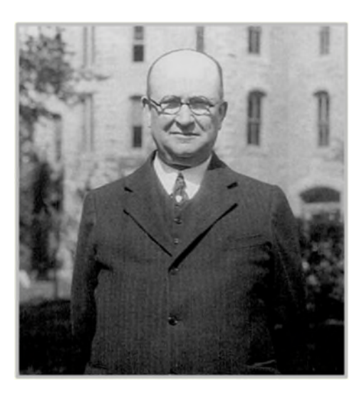
by H A Ironside

Before seeking to answer this question, which seems to be a perplexity to some, it might be well to state, as briefly as possible, what is meant by the period of judgment; as this paper will probably fall into the hands of some who as yet have given but little attention to prophetic teaching. In doing this it will be necessary to do little more than refer to a large number of passages of Scripture, many of which the lack of space will forbid quoting in full, but it is hoped the reader will refer to any that are unfamiliar to him.