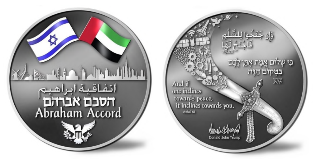
Medal commemorating the Abraham Accord signed by the US, Israel, and the United Arab Emirates in August 2020.

Plainly, the masterminds behind New World Order are planning to create a One World Religion comprising members of the 'Abrahamic faith'. The proposed new Temple on the Temple Mount will probably be presented to Muslims as a 'House of Prayer' that will be pleasing to Allah.