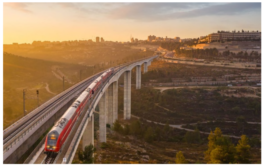
Current rapid rail link between Tel Aviv and Jerusalem, introduced in 2019.

Last week the Airports Authority for Israel announced that a new, ultra-modern terminal would open at the airport in 2023. This is intended to cater for the anticipated increase in international visitors coming to Jerusalem. The proposed high-speed line, linking the airport to the Western Wall, will operate from this terminal (Estimated travel time: 28 minutes).