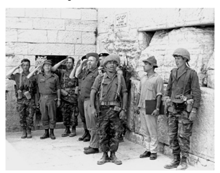
Israeli soldiers at the Western Wall, June 7, 1967

Jews have been praying daily for the past two thousand years for their holy city, Jerusalem. As the city of the Most High God, it represents the very essence of their religion. It is the city in which the Messiah will establish his throne and from which he will rule the entire earth in righteousness.