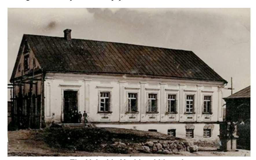
The Volozhin Yeshiva, Lithuania

The emergence of Conservative and Reform Judaism in the 19<sup>th</sup> century did great harm to the Jewish people. A huge proportion came to see the Torah as an ancient manmade artefact that had to be abandoned, or at least watered down, if Jewry was to survive. They preferred to assimilate and intermarry, to adopt the customs and conventions of the cultures around them. So, from this largely secular viewpoint, the idea of returning to the Holy Land simply made no sense.