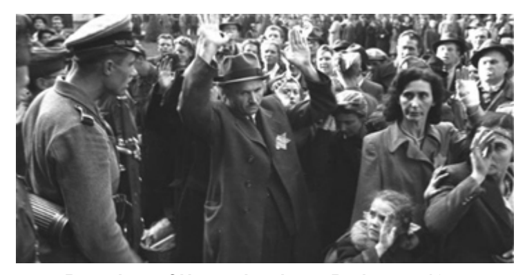
Round-up of Hungarian Jews, Budapest, 1944

It is surprising that the Encyclopedia speaks of Hungary as "a relatively safe place to be" until the Nazis arrived in March, 1944. Its leadership had been under pressure for at least two years to co-operate with the Nazi extermination program. Meanwhile the Nazis were pursuing a savage campaign of persecution against Jews in regions bordering on Hungary. Thus, the Jews of Hungary were never "relatively safe" but were very obviously the next target on the Nazi death list. The Rescue Committee should have been warning the Jews of Hungary of this threat as soon as news of Einsatzgruppen killings became known around end-1941. But they said nothing. They should have been crying at the top of their voices when news of the death camps in Poland began to filter out, but again they said nothing. The Jews of Hungary were lulled into a false sense of security for more than two years as the Nazi vise tightened around them. Ben-Gurion, head of the Mapai party, said next to nothing to the press in Eretz Israel. It hardly got a mention in any of his speeches. Future president of Israel, Chaim Weizmann, said even less.