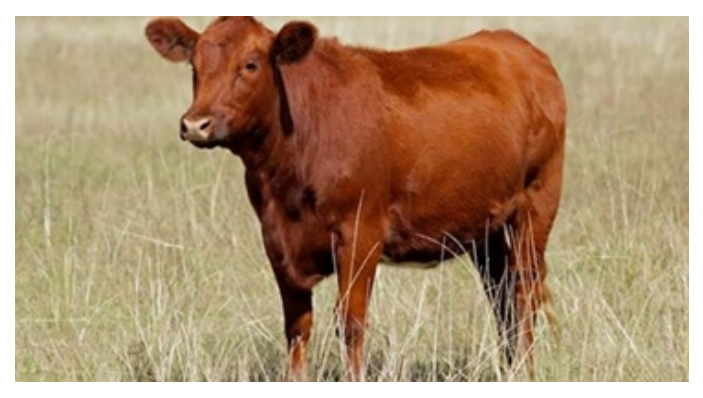
A modern attempt to breed a red heifer.

In a pathetic attempt to justify his decisions, he wrote: "We should certainly respect the Temple Mount as an historic site of our ancient past, but we should not disturb the Arabs who were using it for what it was now – a place of Moslem worship." It is difficult to read these words and not cringe. Some have tried to excuse this man on the grounds that he simply didn't understand the importance of the site to the Jewish people, but this is ridiculous. Every Jew on earth is taught the importance of this holy site from childhood. It would be inconceivable that a member of the Israeli cabinet could exhibit such gross ignorance, and even attempt, years after the fact, to exonerate himself in this way.