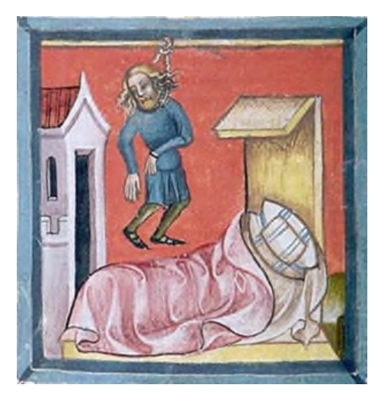
Ahithophel takes his own life [German manuscript c.1360].

We have given these many examples to show that the Word of God warns <u>repeatedly</u> of conspiracies against God's people. The pastors and preachers today who belittle those who warn of similar conspiracies against the church are denying God's Word. The Apostle Paul tells us that, as the End Time approaches, "evil men and seducers will wax worse and worse" and that after he left this world (in the first century AD!) "grievous wolves" would enter in. The church today is being attacked from without by the modern counterparts of Sanballat and his confederates, and from within by the modern equivalents of the genius Ahithophel, along with a seemingly endless stream of false prophets like Shemaiah and Noadiah.