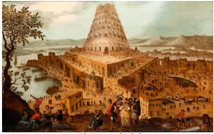
The Tower of Babel by Hendrik van Cleve III, 16th century

If God had not intervened, the conspiracy of Nimrod would have had catastrophic consequences for mankind. All political power on earth would have been concentrated in one man, a person fully imbued with the wrath of Satan. By breaking mankind into a large number of language groups and causing the nations to scatter, the LORD broke the back of this conspiracy. This was by far the greatest visible intervention by God in the affairs of man since the Flood.