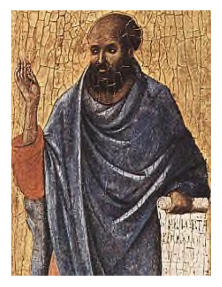
Ezekiel by Buoninsegna, c 1300

This church is very similar to the counterfeit religious institution that Ezekiel described when the LORD took him in spirit to see the Temple in Jerusalem. He was shown four scenes in succession. In the first he saw the "image of jealousy" at the door of the inner gate that faces north. This was intended to deliberately provoke the wrath of God and may not have been visible to the public.