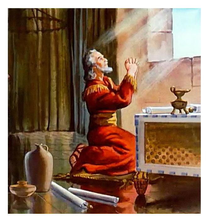
The prophet Daniel at prayer

If even a small number of <u>true believers</u> are praying against the Enemy and his devices, they can greatly impede his progress. This is why the work of the New World Order has accelerated so much in recent years. The number of true believers who are down on their knees and fighting this terrible battle has fallen dramatically. With the prayers of the saints contracting in this way, the Enemy is advancing in leaps and bounds.