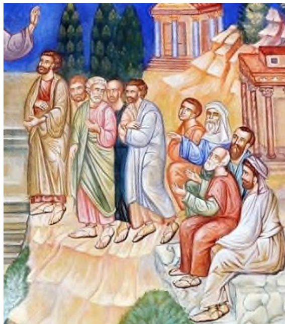
An audience listens to the Apostle Paul [Detail]

These believers were to comfort one another by sharing the good news of the Rapture, an event that could occur at any time. To comfort means to reassure, to allay anxiety and put a person’s heart at rest.