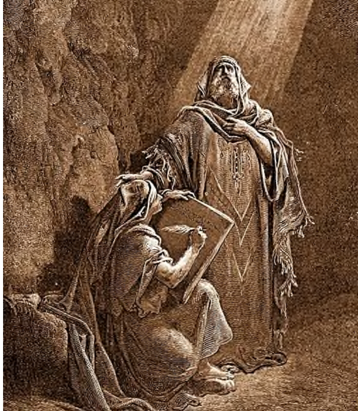
Baruch and Jeremiah

A few years ago I was chatting with a believer in my home town who liked to take unusual trips abroad for his vacation. In those days, when virtually no-one went to Eastern Europe, he booked a trip to Leningrad, now known as St Petersburg. The USSR was still intact at the time and strict rules had to be observed by visitors.