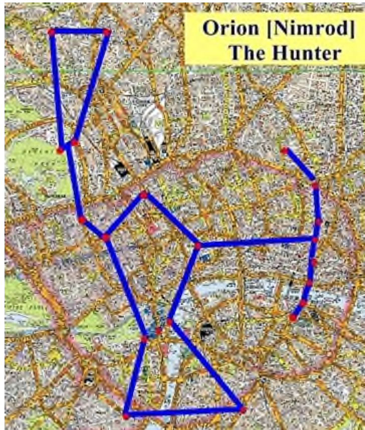
Asterism over central London – 'As above, so below'

Once of the most remarkable Psalms, from a prophetic standpoint, is #2. It opens with a question: