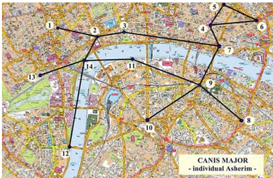
The 'Canis Major' asterism (star pattern) that spans central London. The nodes consist of obelisks and prominent spires.

“O man, who art thou that repliest against God? Shall the thing formed say to him that formed it, Why hast thou made me thus?” (Romans 9:20)