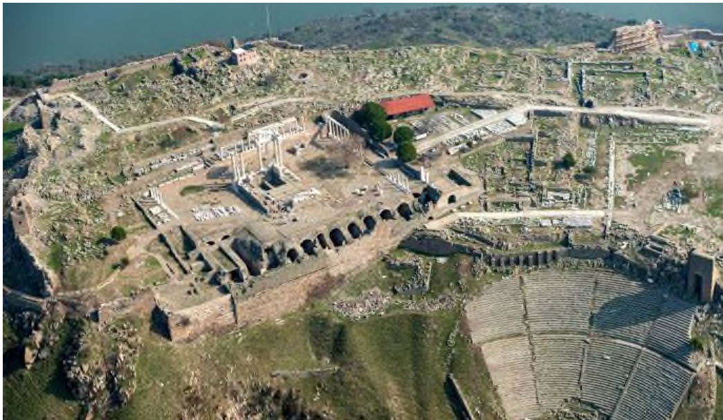
The surviving temple ruins of ancient Pergamum. Their size and extent reflect the importance of this center in pagan worship.

Since Satan is a created being, he can be in only one place at a time. We know he has a throne somewhere in the lower heavens from which he directs his army of fallen angels. Practitioners of the occult believe this location is the celestial body known as Saturn. As Christians we don't care about such matters, but we do need to take note of a statement that Jesus made concerning Satan's throne here on earth. At the time he referred to it (Revelation 2:13), he confirmed that it was located in Pergamum, a city in western Turkey close to the Aegean Sea (Its modern name is Bergama in the province of Izmir).