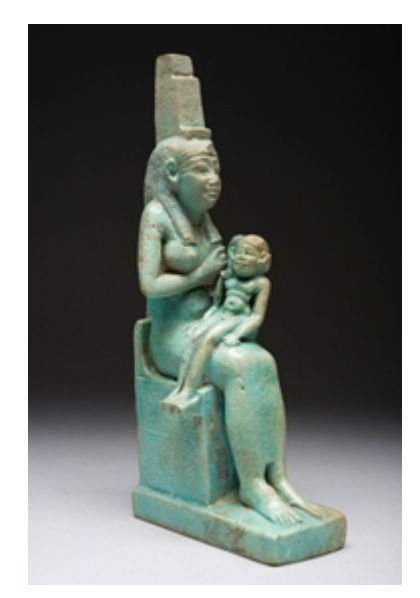
Isis suckling Horus

Note that Mackey reassures the reader that it is possible to venerate the generative power of the phallus "without the slightest reference to any impure or lascivious application." As Masons advance into the higher degrees this form of worship receives even greater emphasis.