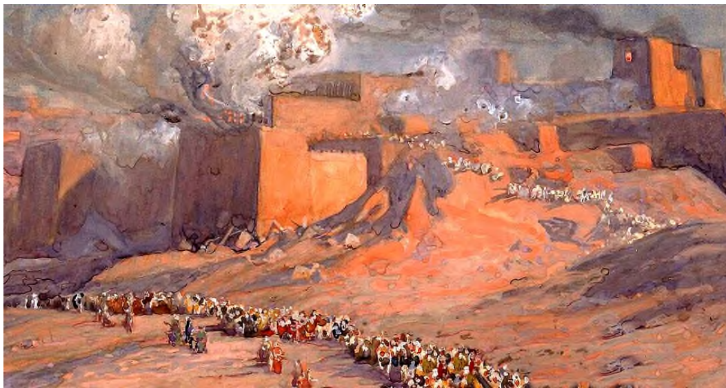
Fall of Jerusalem and the Babylonian captivity, 586 BC

To this we must add their indifference to the plague of sexual exploitation, abuse, abduction, torture and rape of women and children. It is beyond our comprehension.